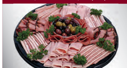
Deli Trays Many sizes and options available.

FREE QUART OF OUR HOMEMADE BBQ SAUCE with your order over $40 Expires June 30, 2010