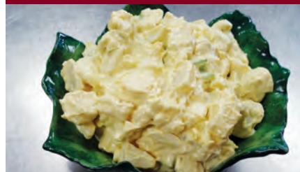
Homemade Potato Salad and many other Salads including: Chicken Almond Salad, Tuna Salad, Broccoli Bacon Salad, Turkey Jerky Salad