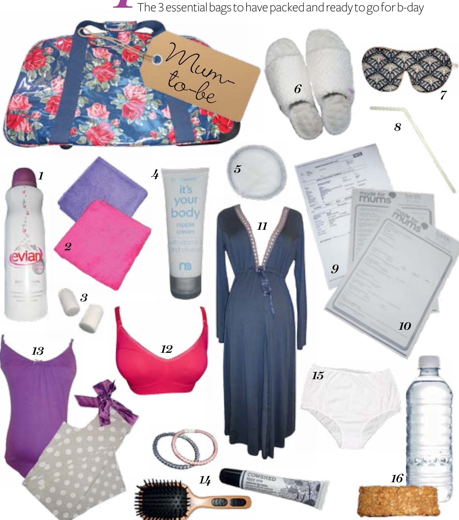
1. Facial spray 2. Flannel 3. Ear plugs – in case ward is noisy at night 4. Nipple cream 5. Breast pads 6. Slippers 7. Eye mask 8. Straws to make drinking in labour easier 9. Medical notes 10. Birth plan, download a template at madeformums.com 11. Dressing gown 12. Nursing bra 13. Change of nightwear 14. Toiletries 15. Undies, either very old comfy ones or disposables 16. Cereal bars, snacks, water, small juice cartons to keep up your energy BAG Royal Rose Wheeled Holdall, £110 (cathkidson.co.uk)

52 Practical Parenting & Pregnancy June 2012 Supporting parents for 25 years madeformums.com madeformums.com supporting parents for 25 years June 2012 Practical Parenting & Pregnancy 53