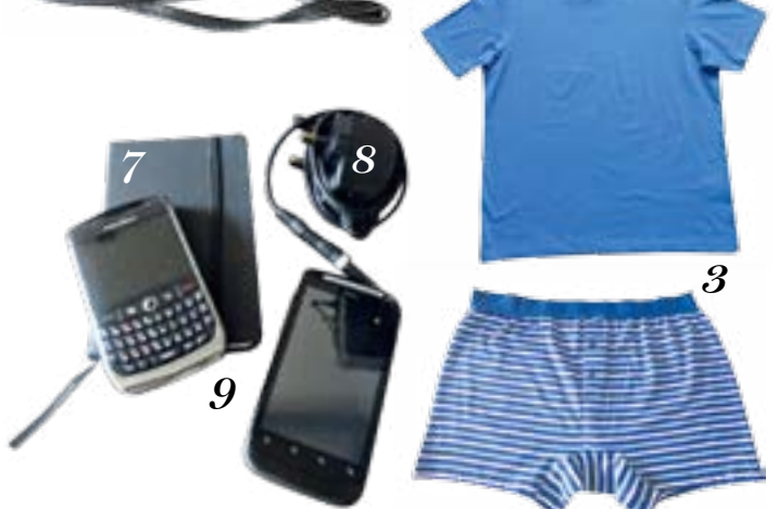
1. Money for the car park 2. Towel 3. Change of undies 4. Toiletries 5. Camera 6. Snacks and drinks 7. Address book in case you can't use the mobile and need to spread the news via payphone 8. Chargers for camera and phones 9. Mobile phone, yours and bis 806 Black Mother care Messager 8ag 629 99 (mother care on)