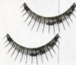
FEATURE AMANDA PAULY PRODUCT PHOTOGRAPHY POXLEYES CELEBRITY PHOTOGRAPHY RETNA AND REX FEATURES

Add a fail-safe flirty flutter with Eylure Black Widow False Eyelashes, £7.10.