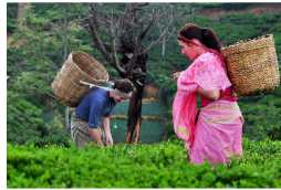
Guests dressed in local attire plucking tea.

The Tea Factory is the place to stay for immersing in the world of tea. Housed within the hotel is a small tea factory that produces black tea with leaves grown in the hotel's organic plantation. Guests can go on a tour of the mini factory to learn about the process of tea production, indulge in a tea tasting session with a professional taster, and pluck their own tea to bring home as a souvenir.