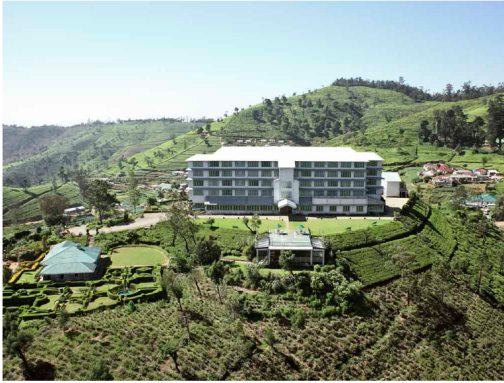
The Heritance Tea Factory is restored from a tea factory that was built in the 1930s during the British Raj. (Photo: Heritance Tea Factory, Nuwara Eliya, Sri Lanka)

Just a few hours' drive away from its capital Colombo is Sri Lanka's hill country, a mountainous region draped in emerald greenery filled with tea plantations. This landscape has attracted many tea aficionados seeking new brews of adventure.