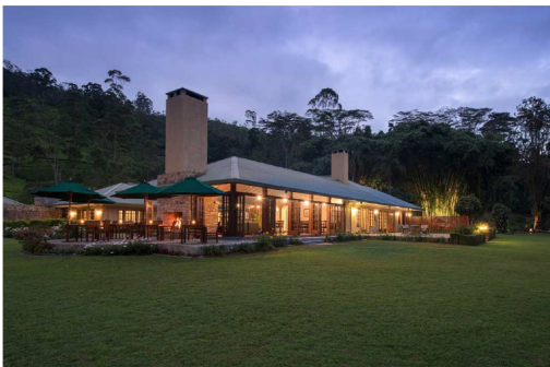
Each of the Ceylon Tea Trails bungalows comes with a house manager, chef, butler, and houseboys.

Also worth a day trip is the sacred Adam's peak, a mountain three hours away from the hotel that is scaled each year by thousands of devotees from several religions. Many travel here to catch a glimpse of the shadow of the peak, cast by the sun on the misty clouds below just after dawn. On a clear day, Colombo, which is 65 kilometres away, can be seen.