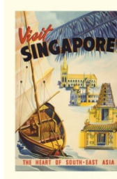
A vintage travel poster promoting Singapore.

On display are over a hundred works of art by great artists that include French artist and graphic designer A M Cassandre (famed for his Normandie series), French painter and lithographer Jules Cheret (who became a master of Belle Époque poster art), and Italian poster art designer Leonetto Cappiello. The exhibit spotlights rare vintage travel posters from the 1930s to the 1950s highlighting Asian destinations.