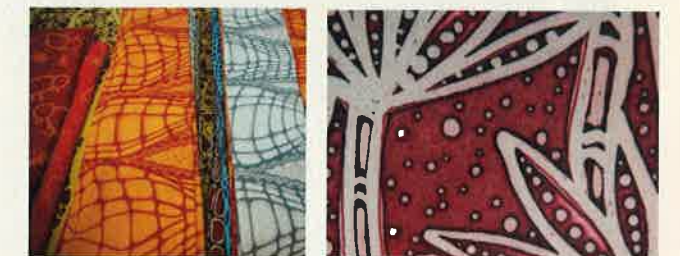
Left: local child helps hang the art show. Above: Photo of bush trip and some examples of printed fabric.

“ Making art makes me feel happy. When I'm down, it makes me relax. ”