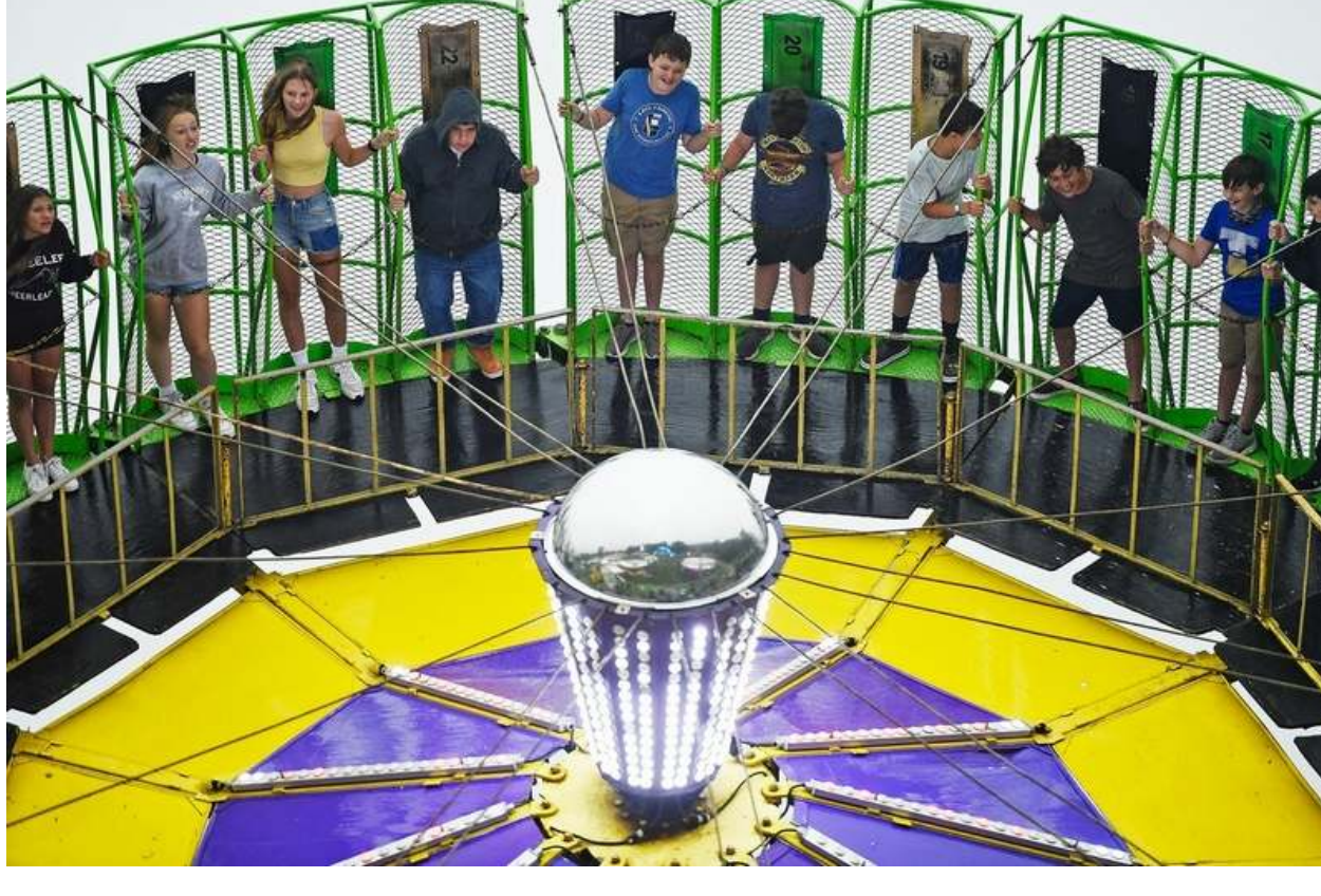
Fairgoers ride the Roundup on Thursday, July 8, 2021, the opening day of the North Stonington Agricultural Fair.

BUY PHOTO REPRINTS ( https://theday.smugmug.com )