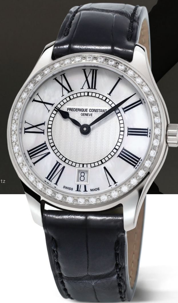
ladies classics quartz

Gwyneth Paltrow supports DonorsChoose.org live your passion