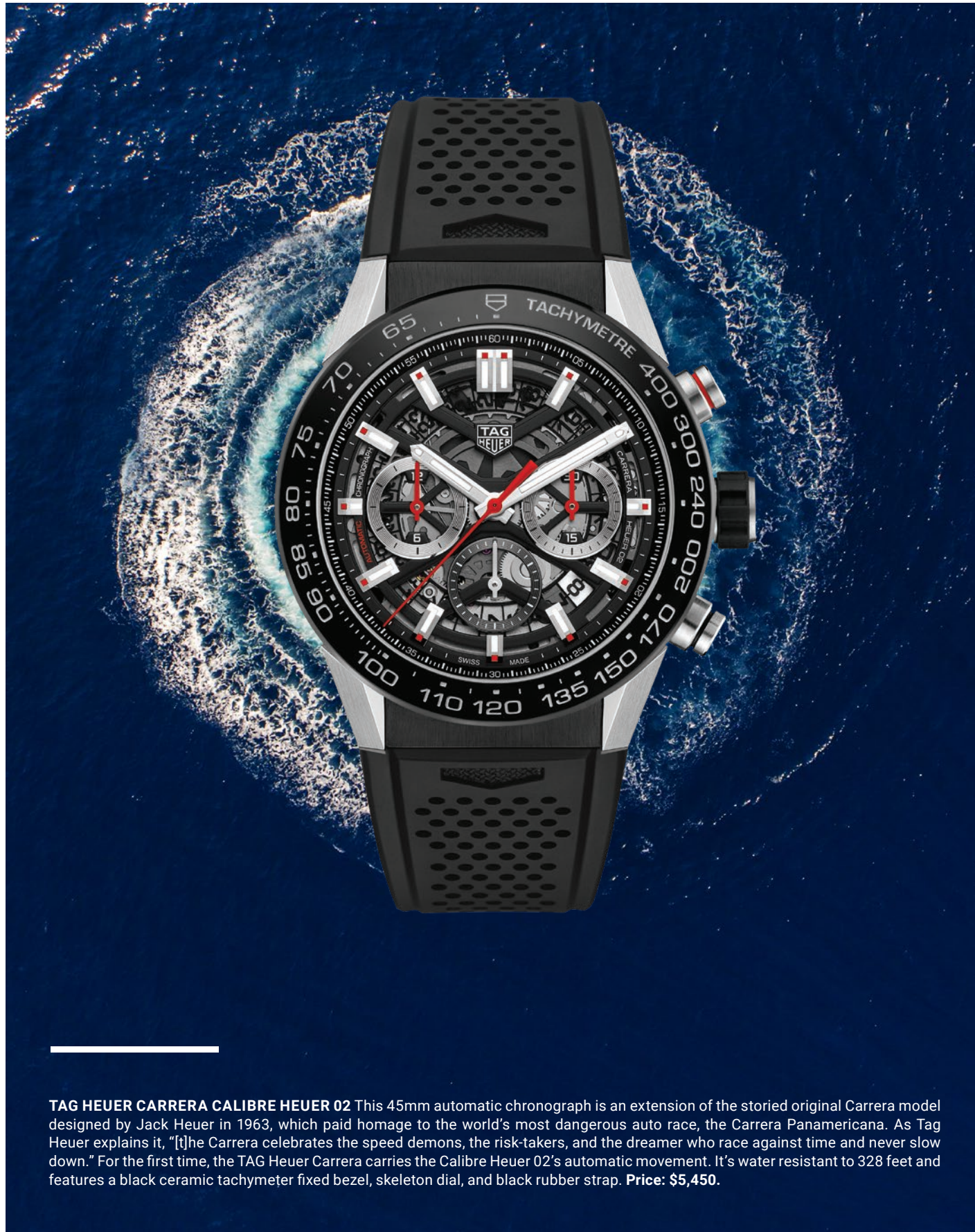
TAG HEUER CARRERA CALIBRE HEUER 02 This 45mm automatic chronograph is an extension of the storied original Carrera model designed by Jack Heuer in 1963, which paid homage to the world's most dangerous auto race, the Carrera Panamericana. As Tag Heuer explains it, "[t]he Carrera celebrates the speed demons, the risk-takers, and the dreamer who race against time and never slow down." For the first time, the TAG Heuer Carrera carries the Calibre Heuer 02's automatic movement. It's water resistant to 328 feet and features a black ceramic tachymeter fixed bezel, skeleton dial, and black rubber strap. Price: $5,450.

If it can survive being ejected from a plane, it can survive near enough anything.