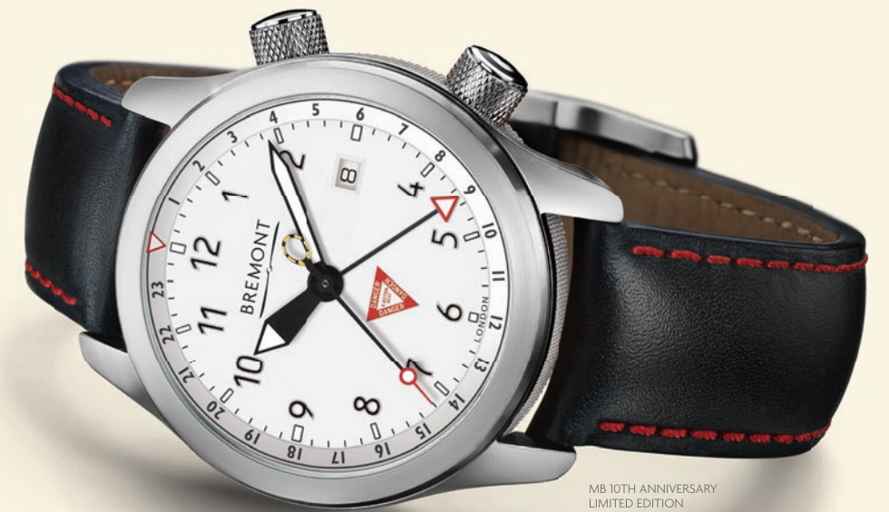
MB 10TH ANNIVERSARY LIMITED EDITION

Should you treat your Bremont MB watch with respect? Not really. We don't. We freeze it, we bake it, and we shake it. For hours on end. Then we shoot it out of a plane. Just to make sure it's as tough as we claim it is. What's more, it has been assembled and tested at our headquarters in Henley-on-Thames. So don't worry about looking after a Bremont MB. It can look after itself.