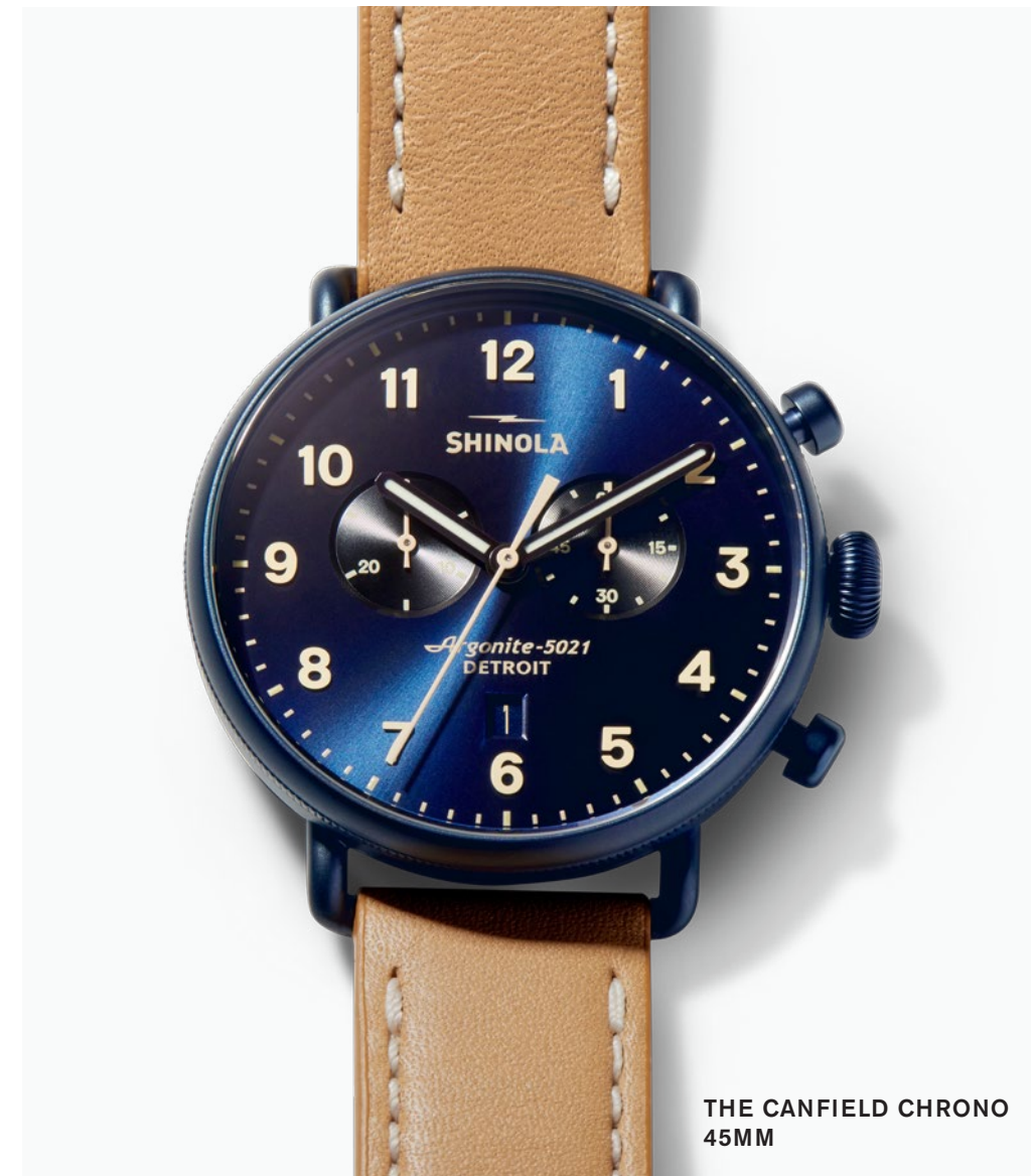
THE CANFIELD CHRONO 45MM

Hand assembled in Detroit with Swiss and other imported parts.