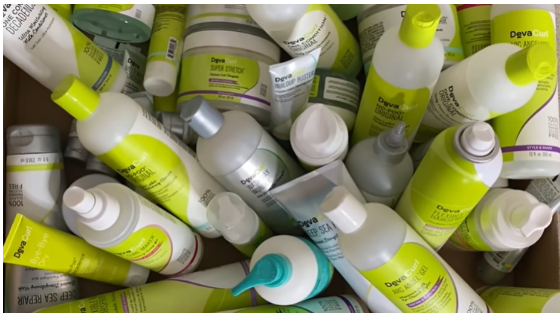
Malik advises everyone to not throw away the product containers, showing her collection of the many DevaCurl products she has used

The Lawsuit mentions that Propylene Glycol, Cocamidopropyl Betaine, Phenoxyethanol and many more ingredients have been proven as allergens, irritants and harmful for human skin and hair. Another chemical Diazolidinyl Urea, a formaldehyde-releasing preservative when exposed to high heat can change up the formula of the chemical to act as a relaxer, thus changing the curl pattern of the user.