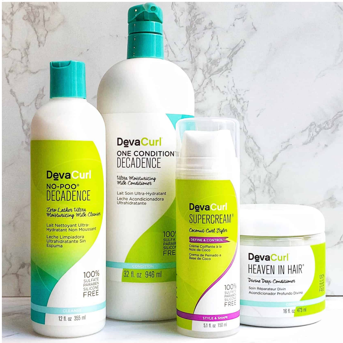
The DevaCurl No--poo range (no shampoo range)