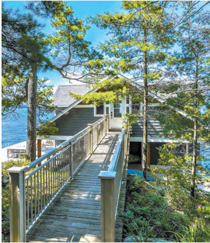
Muskoka cottages for rent have increased by 8 per cent since 2013

Many Ontarians achieved their dream of owning a cottage over the past few years. But with interest rates soaring and prices sinking in cottage country, there's been an uptick in cottages listed on the rental market — including in the coveted Muskoka region.