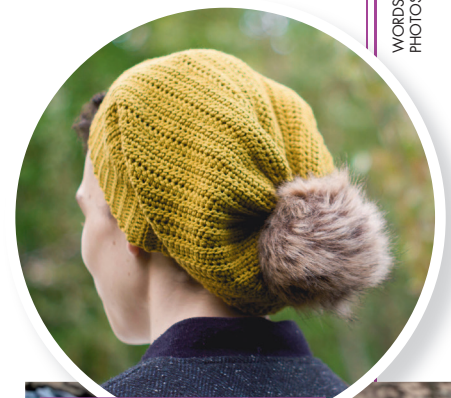
Marta's patterns include warm hats and socks