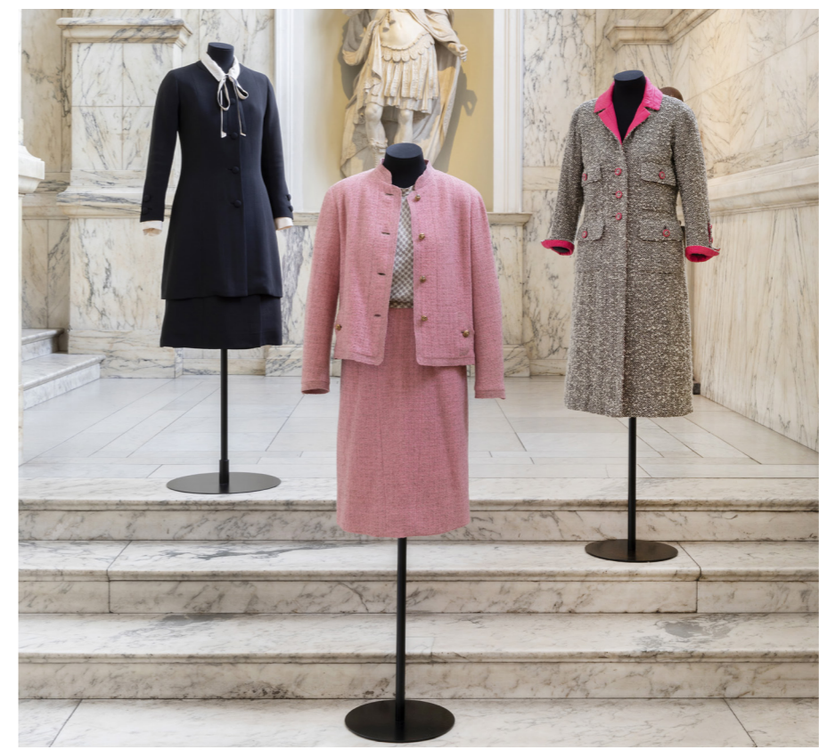
Gabrielle Chanel. Fashion Manifesto at the Victoria and Albert Museum, London, 16 September 2023 – 25 February 2024. Presented in partnership with Palais Galliera, Fashion Museum of the City of Paris, Paris Musées. With the support of CHANEL