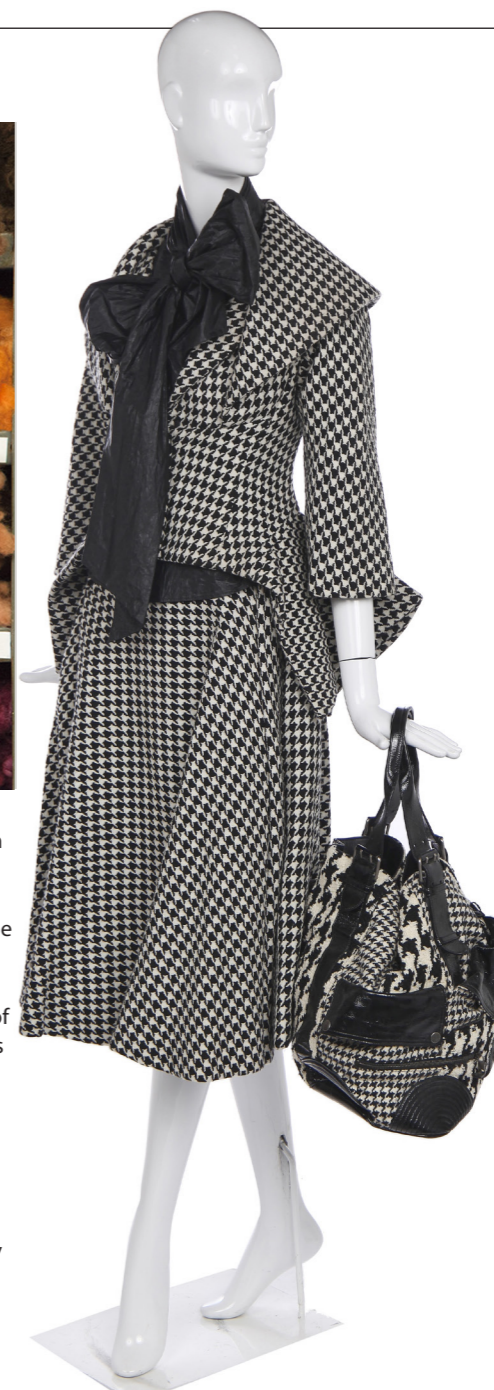
Alexander McQueen often favours the houndstooth tweed - a larger scale version of dogtooth - for his designs. This combo sold for £3,600 at Kerry Taylor Auctions earlier this year.

With a wealth of tweed varieties to choose from such as windowpane, herringbone and check, in addition to the numerous colourful blends, there's likely to be a tweed for all tastes for sewing a stylish garment this winter. Thanks to the modern availability of