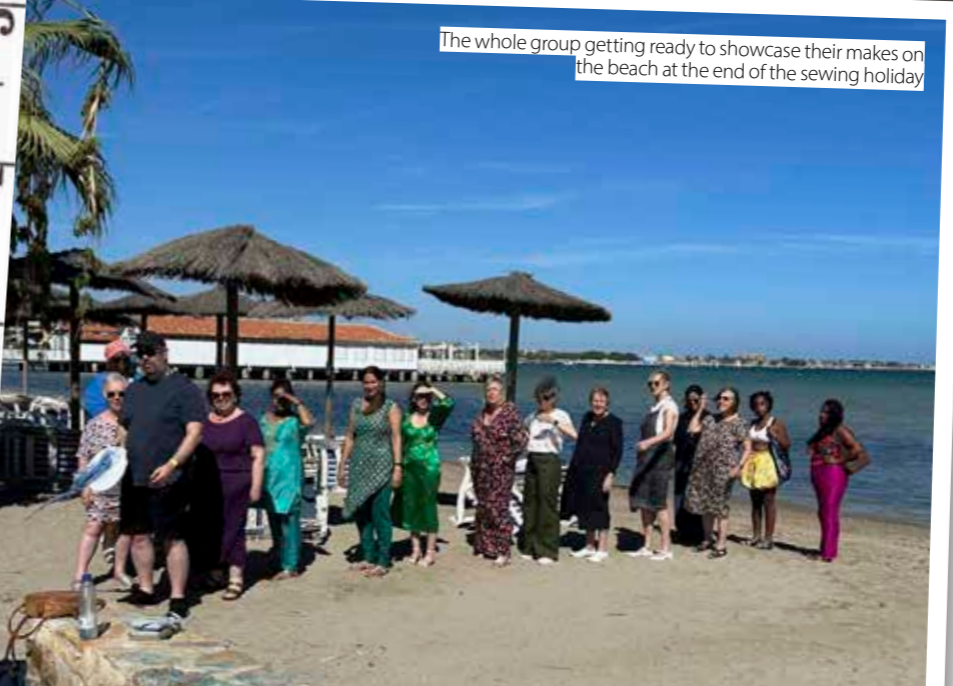
The whole group getting ready to showcase their makes on the beach at the end of the sewing holiday