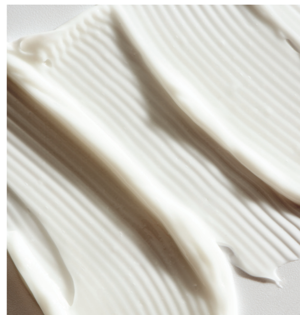
TBT® (TURN BACK TIME) CREAM A clean retinol alternative that's gentle.

Change your skin for the better with our TBT® Serum! Supercharged with mandelic acid, bakuchiol, and other powerhouse anti-aging ingredients, TBT Serum is a hydrating leave-on exfoliant that helps reduce the signs of ag-