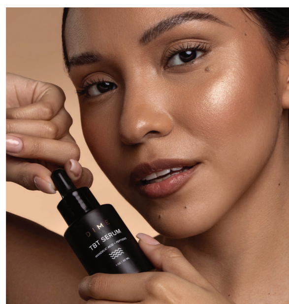
TBT® (TURN BACK TIME) SERUM Try our hydrating leave-on exfoliant!

ing and promotes radiant, tight, and bright skin.