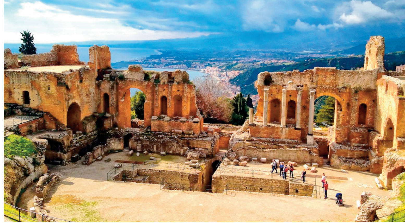
It is the mixing of the old and the new, the ancient with the modern that keeps culture alive and Taormina's film festival is doing exactly that

ners of the globe to attend Italy's iconic film festival which dates back to 1955.