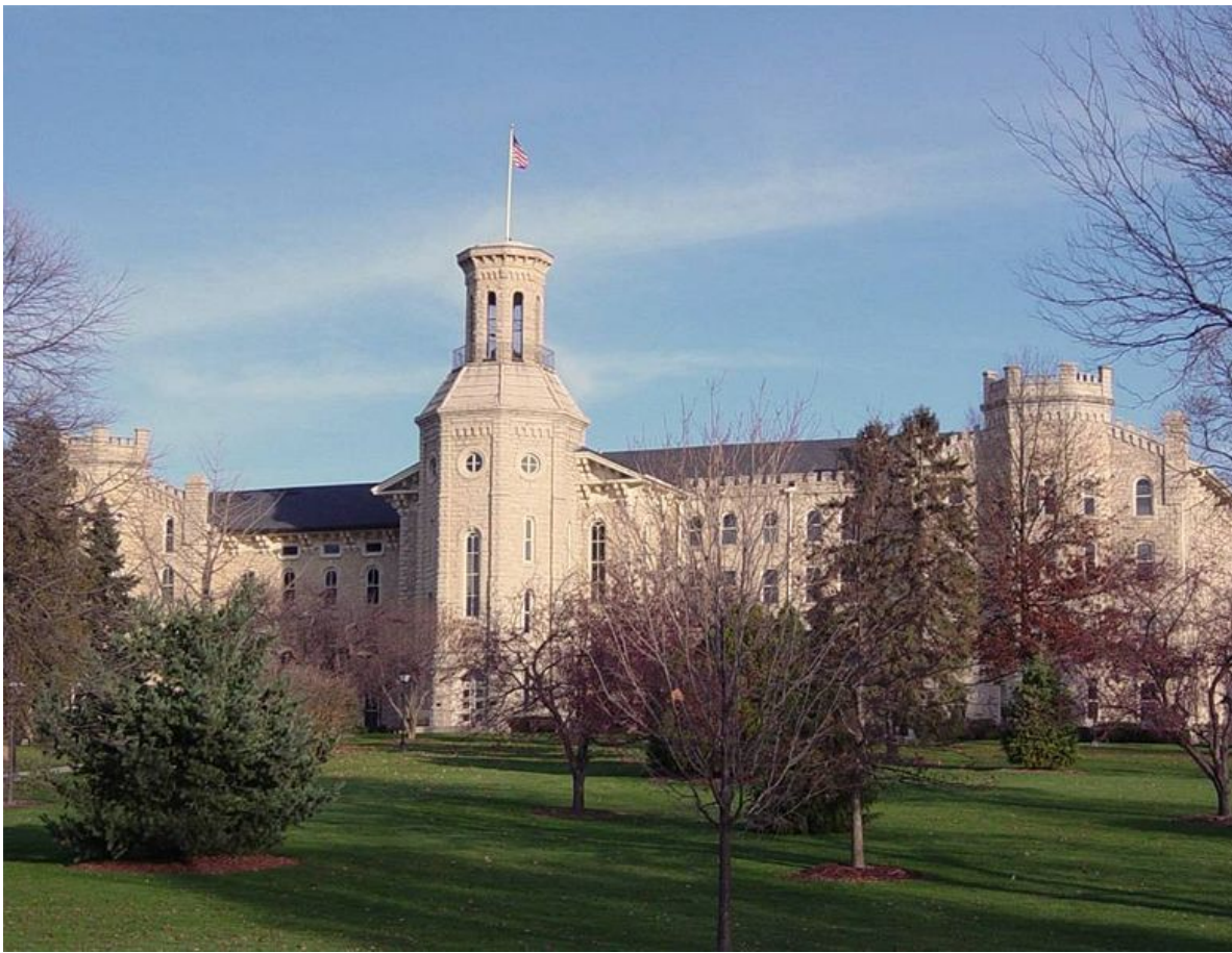
Wheaton College