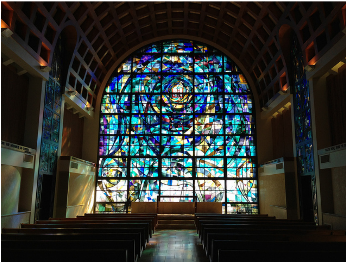
Pepperdine University Chapel

Nestled in the Santa Monica Mountains of Malibu, California, Pepperdine University is coveted for its gorgeous scenery and inspiring locale. Pepperdine also holds dear to its Christ-guided courses and all-around top-quality academics, making it a hard school to get into and well worth it once you do. Architectural eye candy is a sweet bonus. Pepperdine's Stauffer Chapel sits near the Pacific Ocean awing visitors with its elegant gardens and gleaming stained glass windows reminiscent of European cathedrals.