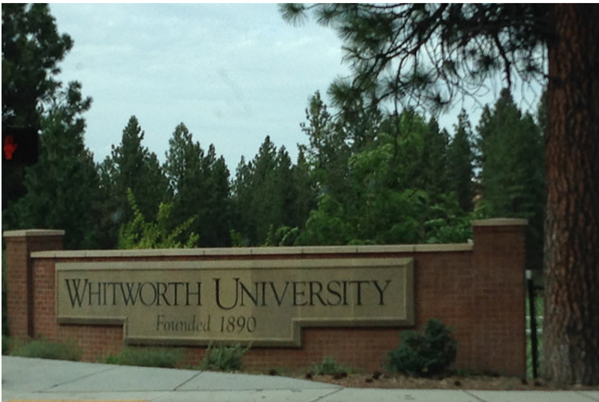
Whitworth University

Situated among pine trees in residential Spokane, Washington, the red brick buildings of Whitworth University have long been filled with intellectual and spiritual explorers. This Christian liberal arts college offers a variety of bachelor’s and master’s degree programs (more than 60) and boasts an impressive average student:faculty ratio of 11:1. Whitworth is also a member of the Council for Christian Colleges & Universities, as well as the Association of Presbyterian Colleges and Universities. It’s known as one of the best institutions in the western United States, and it rightfully ranks in our top 10 for honoring God while delivering first-class academics.