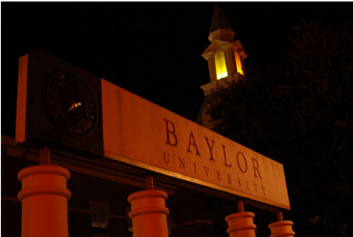
Baylor University

Academic excellence goes hand-in-hand with a rich Christian culture at Baylor University . This prominent research institution in Waco, Texas (and NCAA basketball powerhouse) was chartered by the Republic of Texas in 1845, and today it stands as the largest Baptist university in the world. While Baylor maintains its Baptist traditions, the university really encourages students to explore their beliefs and boasts a diverse student population, representing religions from Buddhism and Islam to Jehovah's Witness and Atheism.