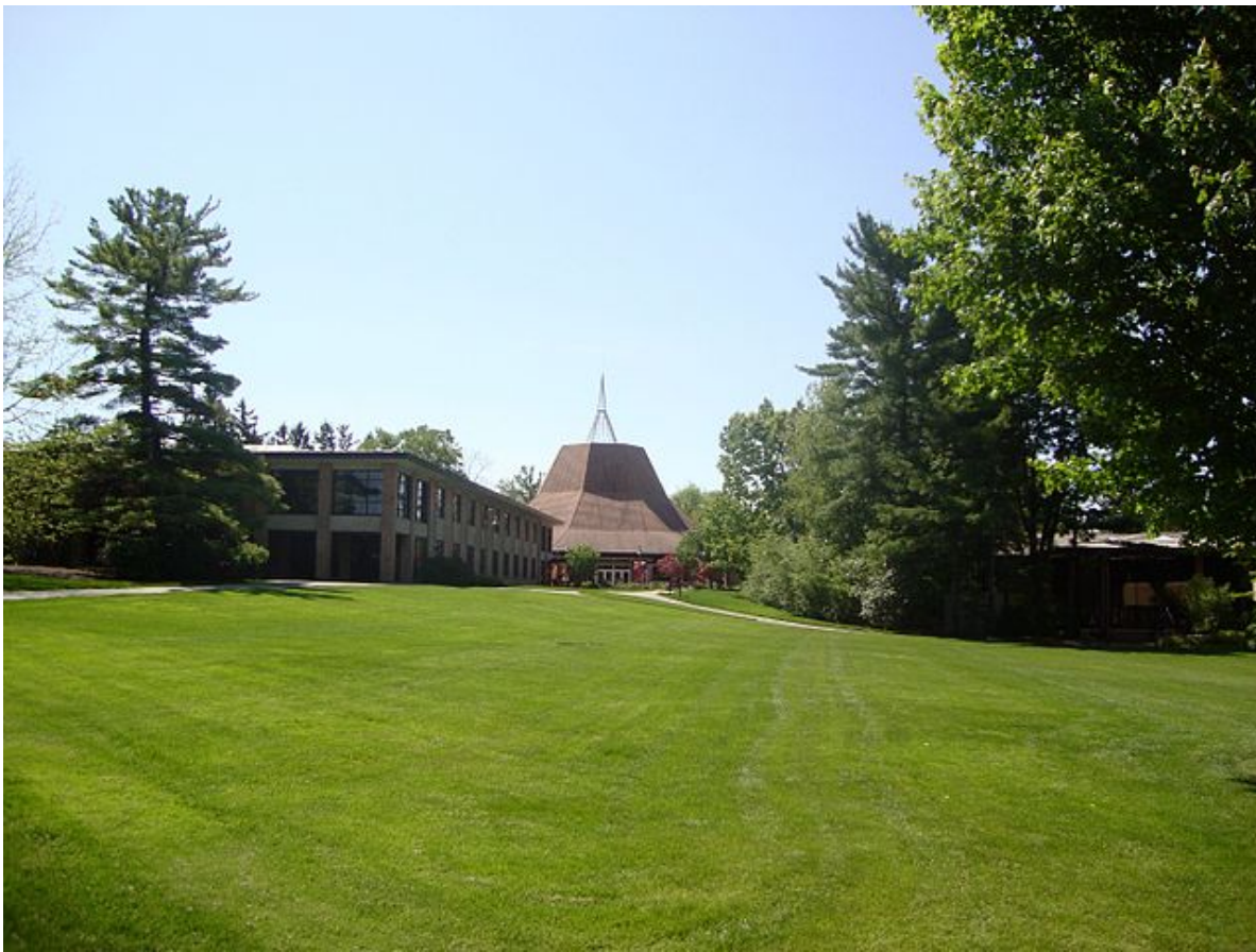
Calvin College

Well-tied to its namesake, Calvin College is named after the John Calvin, that 1500s pastor and theologian who was instrumental in the development of Calvinism. The same Christian belief system serves as the basis for Calvin College's modern Protestant/Reformationist teachings today. This liberal arts college was founded in 1876 in Grand Rapids, Michigan and is now a proud member of the Council for Christian Colleges and Universities (CCCU). Academics at Calvin are rigorous, designed to prepare the Christian student to answer their calling. Alumni who might attest to that include Betsy DeVos, the Secretary of the Department of Education under President Trump and former chair of the Republican Party of Michigan.