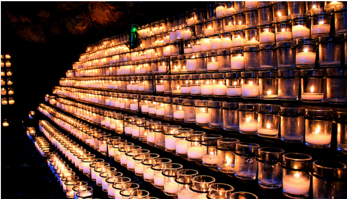
University of Notre Dame

Famous for its (historically) elite football program, the University of Notre Dame is equally famous for its academics. This picturesque institution in Indiana was founded in 1842 by the Congregation of the Holy Cross, and as God would have it, those infamous Fighting Irish are still known today as mighty smart Catholics. Notre Dame makes the Catholic faith a core aspect of its culture and academics. If you're looking to study from a faith-based perspective at the best of the best (highest retention and graduation rates on this list), and you can pass muster (second lowest acceptance rate after College of the Ozarks), this is your school.