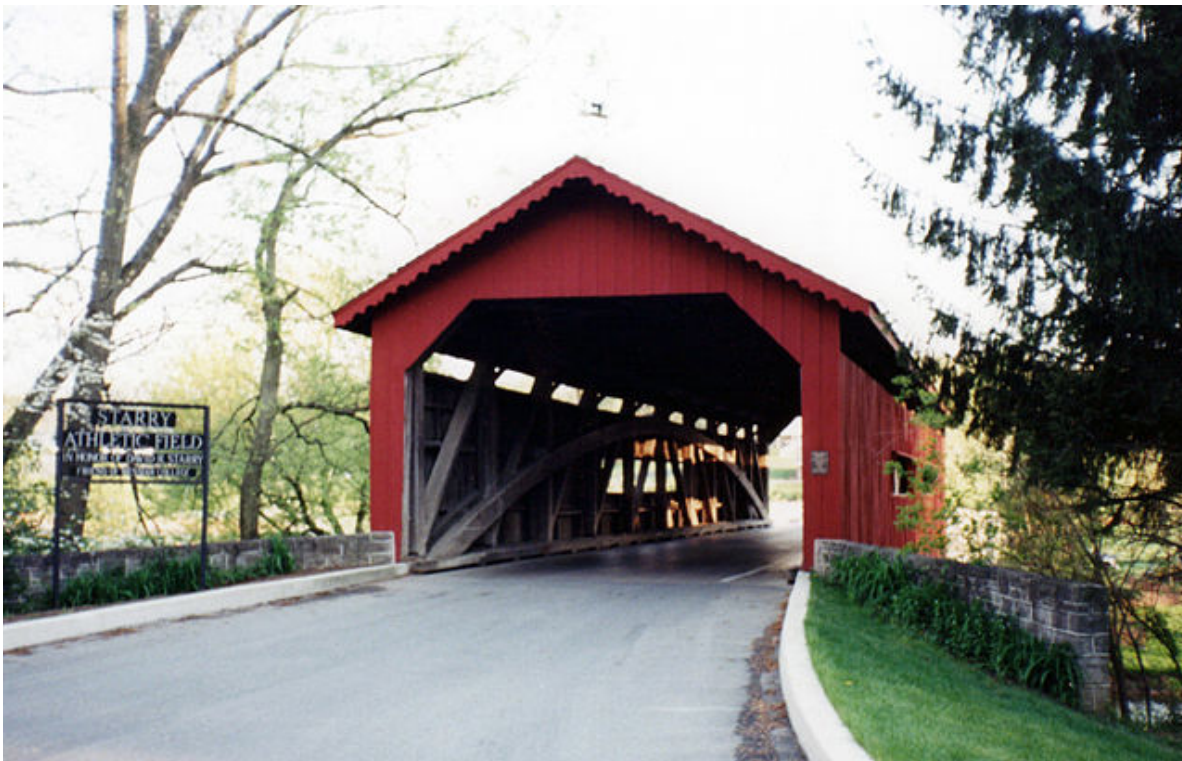
Messiah College

Arguably the most conservative institution on this list, Messiah College is perfect for the conscientious student who wants structure, a morally strong environment, no-nonsense Christian fellowship, and a well-respected degree to boot. Located in Mechanicsburg, Pennsylvania, this four-year college was founded in 1909 by the Brethren in Christ Church, and it stays true to its roots by drawing on Anabaptist, Pietist, and Wesleyan teachings. Students and staff are expected to stay true as well, required to sign a Community Covenant outlining Messiah’s requirements regarding beliefs and behavior.