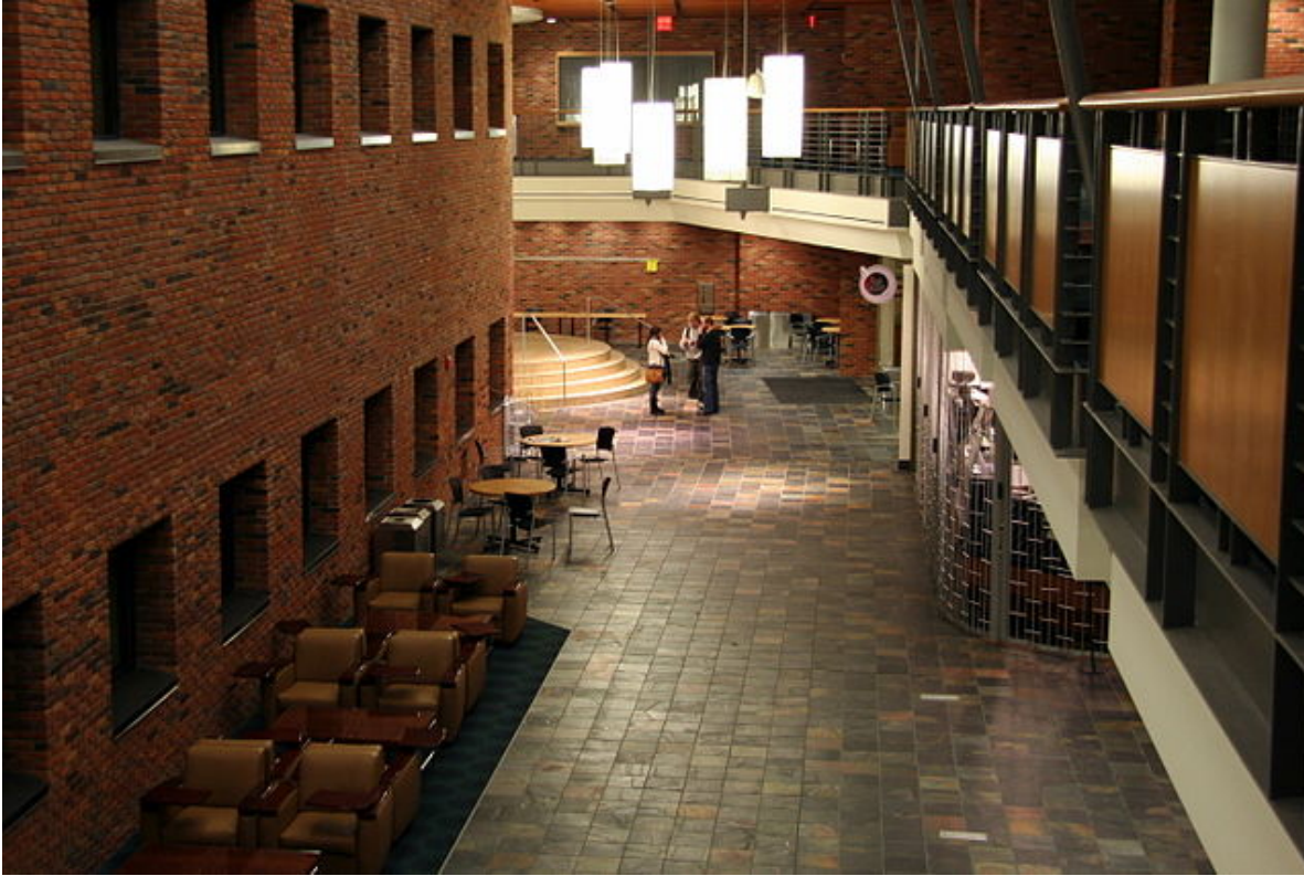
Bethel University

If distance learning is your thing, this could be the school for you. Bethel University of Minnesota is the only college on this list that offers fully online bachelor's degree programs, in addition to its on-campus undergrad and graduate degree programs. The school is easy to get into and it's one of the most affordable on the list, while still managing to offer small class sizes and high-quality academics. Bethel particularly stands out for its seminary program. Among the 15 largest accredited seminaries in the United States, Bethel Seminary is available in two locations — the main campus in St. Paul, Minnesota and a second seminary campus in San Diego. Bethel even offers a fully online seminary.