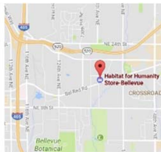
bellevue (425) 641-2643 13500 Bel Red Rd, Bellevue 98005