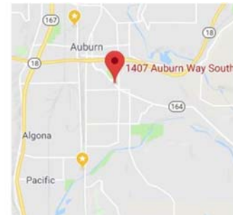
auburn (253) 329-5532 1407 Auburn Way S, Auburn 98002