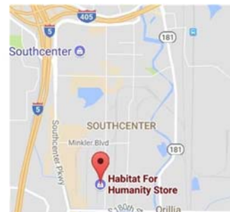
southcenter (206) 957-6914 1185 Andover Park W, Tukwila 98188