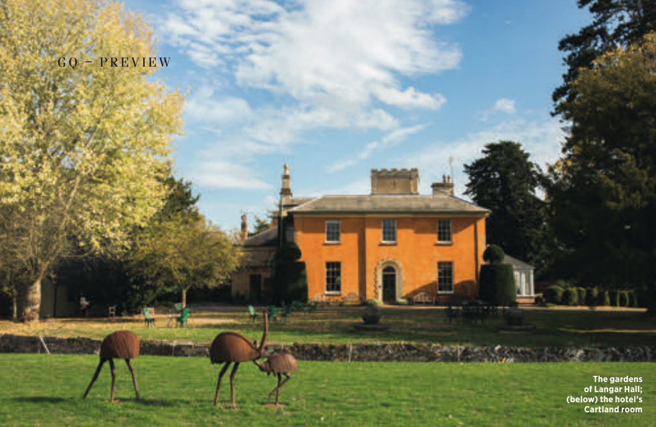
The gardens of Langar Hall; (below) the hotel's Cartland room