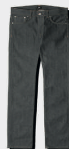
Jeans by Edwin , £50. edwin-europe.com