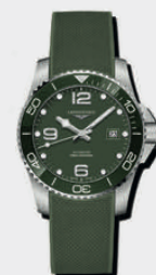
Watch by Longines , £1,230. longines.co.uk