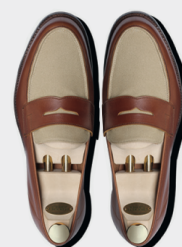
Loafers by Crockett & Jones , £425. crockettandjones.com