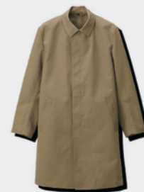
Coat by Muji , £99.95. muji.co.uk