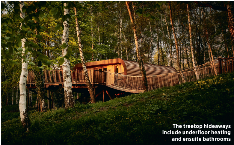
The treetop hideaways include underfloor heating and ensuite bathrooms

Nestled on the hillsides of the Cotswolds and spread over 400 acres of sublime scenery, you'll discover a countryside estate like no other. Part boutique hotel, part adventure hideout, The Fish Hotel is a collection of village-style houses, huts and hideaways offering a back-to-nature sanctuary with a touch of luxury. For those seeking escape from the daily grind of city living you'll be spoilt for choice with this countryside playground.