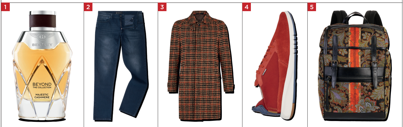
1. Majestic Cashmere fragrance by Bentley Fragrances , £165. bentley-fragrances.com 2. Slim leg jeans by Remus Uomo , £85. remusuomo.com 3. Checked coat by Daks , £650. daks.com 4. Aerantis Trainers by Geox , £120. geox.com 5. Jacquard fabric rucksack by Etro , £985. etro.com