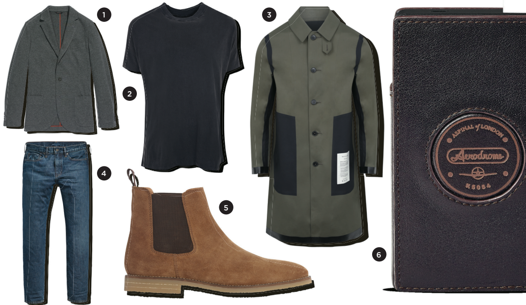
1. Sweater jacket by Loro Piana , £2,485. loropiana.com 2. T-shirt by Topman £18. topman.com 3. Inside out coat by Mackintosh , £945. mackintosh.com 4. Jeans by Levi's Made & Crafted , £110. levi.com 5. Suede boots by Dune , £75. dunelondon.com 6. Aerodrome tech charger pack and case by Aspinal of London £60. aspinaloflondon.com

17 Boulevard Poissonniere, 75002 Paris, France. grandsboulevardshotel.com