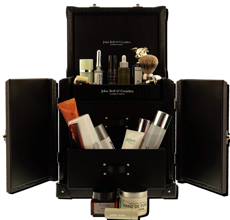
The Ultimate Beauty Trunk by John Bell & Croyden , £4,500.

C leansers, face serums, masks, exfoliators, moisturisers and eye creams – the list of possible steps to add to your daily routine is endless and somewhat confusing. Luckily the experts at John Bell & Croyden, London's luxury pharmacy, have carefully curated the ultimate skincare edit in celebration of sponsoring the British GQ Grooming Awards 2020. Showcasing 20 products in a beautiful leather trunk made in partnership with Rapport London, John Bell & Croyden's exclusive, specialist skincare routine will take you from day to night, one step at a time.