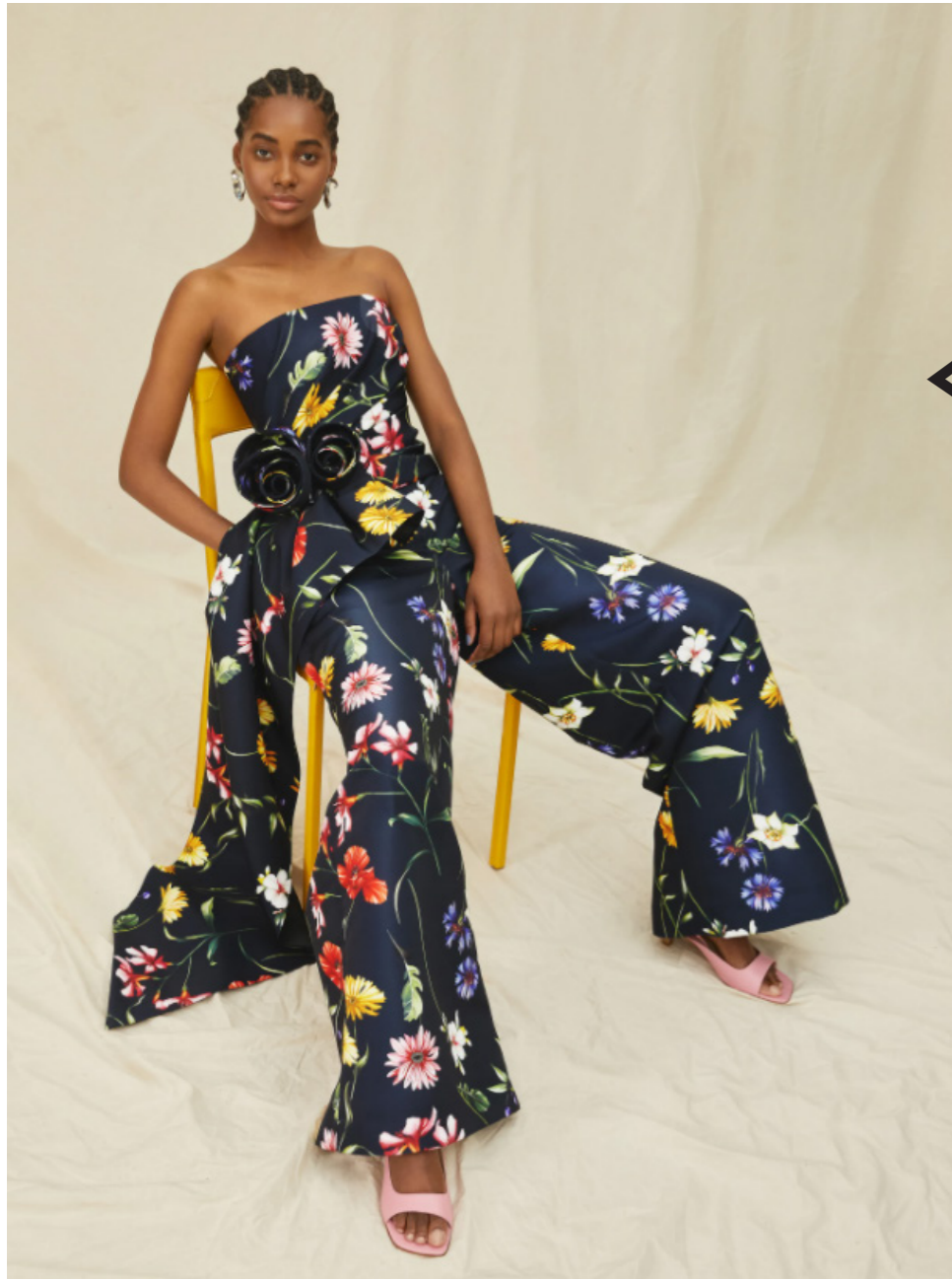
← Oscar de la Renta Resort 2021

“With the pandemic pushing people homeward, these silhouettes saw a new light outside the realm of holidays”