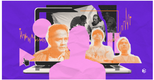
BENILDEAN PRESS CORPS | ESSAY For the love of Philippine cinema: A look at the industry amidst the pandemic