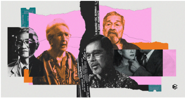
BENILDEAN PRESS CORPS | FEATURE Honoring 100 years of Philippine cinema with TBA Studios' "Habambuhay" documentary