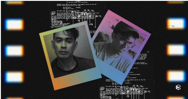
BENILDEAN PRESS CORPS | FEATURE Pride on film: A conversation with LGBTQIA+ filmmakers on queer representation