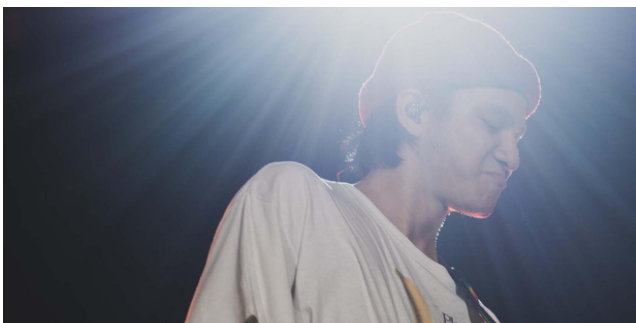
YOU.PH | ESSAY Phum Viphurit and my 19-year-old self