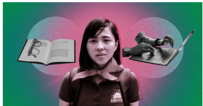
SCOUT MAGAZINE | FEATURE Why Kabataan Partylist's Sarah Elago defends the #LeaveNoStudentBehind movement