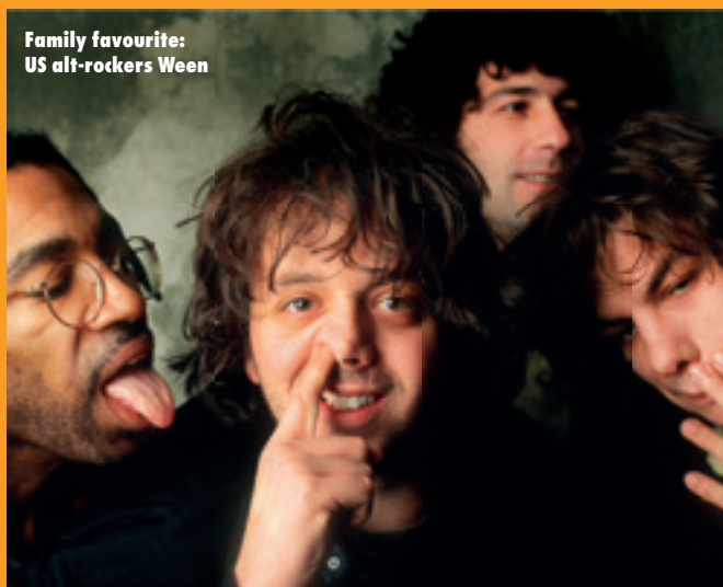
Family favourite: US alt-rockers Ween

My all-time favourite band, and I'm so proud that my kids are really into them, are Ween. One of their big songs was Push Th' Little Daisies [from 1992]. It was from that time when, if you sped up the voice, you'd have a massive hit. I have seen them several times – they're such a