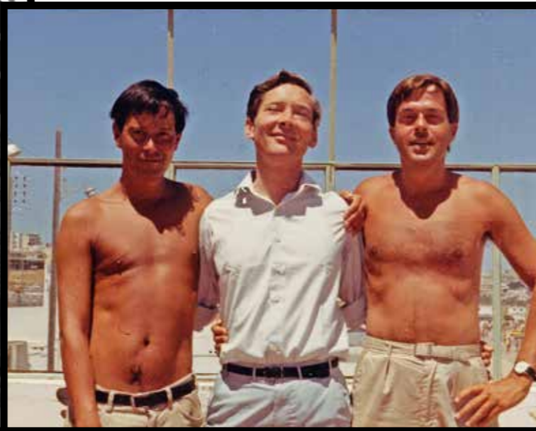
Left: Joe Orton with Kenneth Williams and Kenneth Halliwell on holiday in Tangier.

conscience." In his diary entry dated July 23, 1967, Orton recounts telling Williams about a particularly lustful encounter.