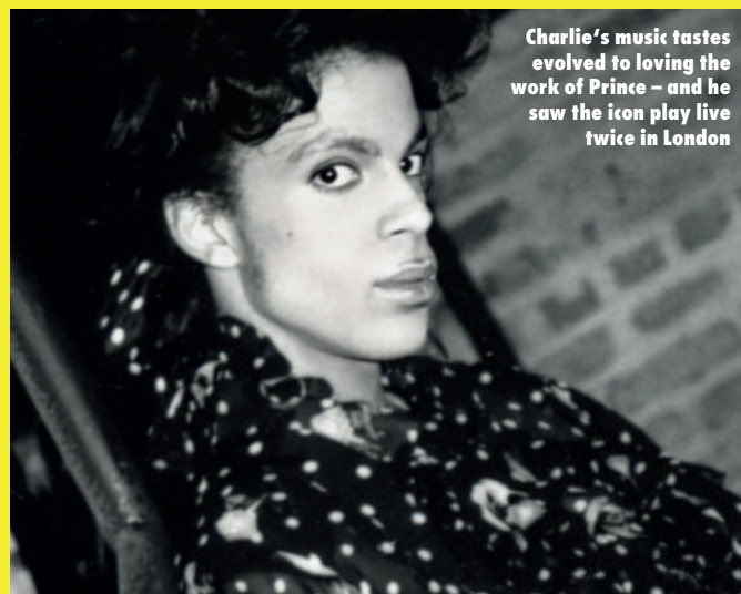
Charlie's music tastes evolved to loving the work of Prince – and he saw the icon play live twice in London