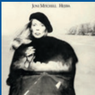
JONI MITCHELL: HEJIRA