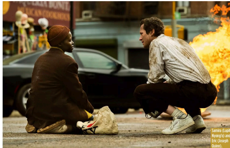
Samira (Lupita Nyong'o) and Eric (Joseph Quinn).

"I really liked the premise of A Quiet Place ," beams Nyong'o, who has history with the genre, having headlined in Jordan Peele's Us . "But what I loved most of all is that they're very character-driven. You really invest in the lives of these people, as you learn about what it's like to live in a quiet world. So when they're in danger, you're so much in their perspective." "I watched the first one in the theatre," Quinn remembers of that 2018 movie, which grossed over $341 million worldwide against a $17 million budget. "I had such a fantastic experience watching this brilliant, horrifying and powerful film. Obviously the second movie was a big success as well, so when I heard that they were doing a third I was thinking, 'I wonder what they're going to do with it?'" What indeed? Day One is the first Quiet Place movie not to be written or directed by John Krasinski. Instead, it's masterminded by indie darling Michael Sarnoski who in 2021 won dynamite reviews for his debut feature Pig . "I'd watched Pig , and was a big fan," says Quinn of Sarnoski's Nic Cage-starring drama. "Seeing a franchise as revered and well-