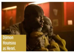
Djimon Hounsou as Henri.