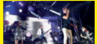
Duran Duran perform at the Kennedy Space Centre in Cape Canaveral, 2019

I still buy everything Nick Cave and PJ Harvey release, and Public Service Broadcasting and British Sea Power [now Sea Power] as well. Also The Four Tops, there are few greater sounds than the ‘huhhrrr!’ that comes in at the beginning of Reach Out I’ll Be There . And, of course, there’s their connection to Little Shop Of Horrors