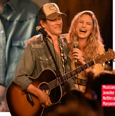
Musician Jennifer Nettles plays Maryanne.