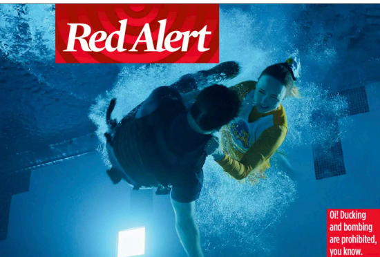
Oil Ducting and bombing are prohibited, you know.