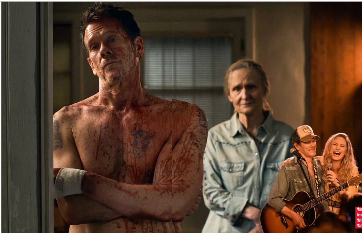
Hub Halloran (Kevin Bacon) is in a bad way.