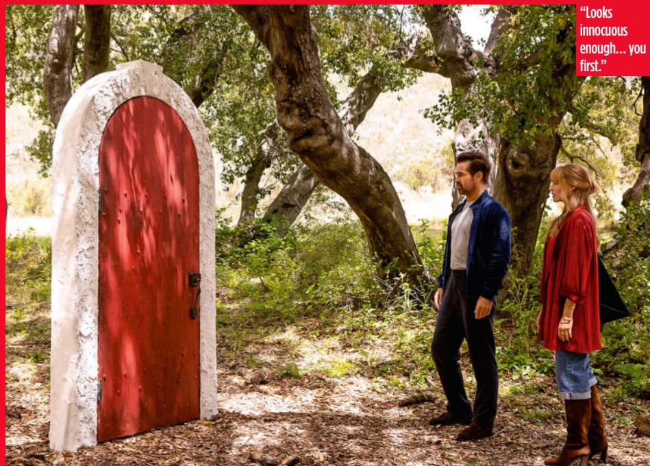
"Looks innocuous enough... you first."

by the likes of Charlie Kaufman and director/actor Albert Brooks.