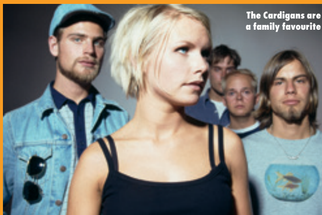
The Cardigans are a family favourite

I don't want to know that much – and I even like not learning the lyrics to songs. I like not knowing and thinking, "Oh, well, this is what I take from it, and this is maybe what he or she meant, but who knows?"