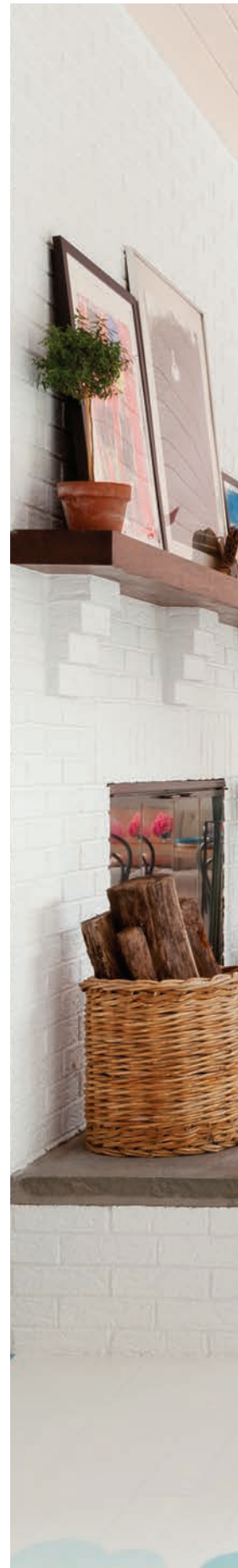
PHOTOGRAPHY: EMILY GILBERT