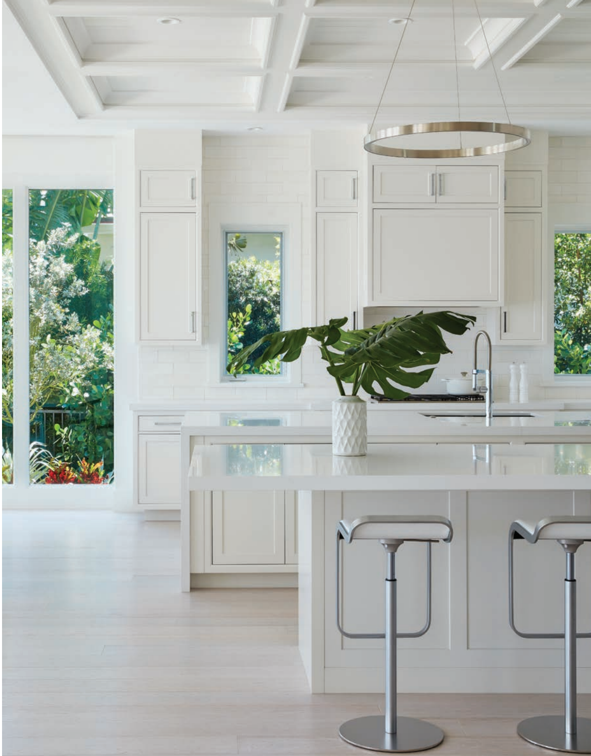
left: The all-white kitchen is accented with chrome lighting from YLighting, and the swivel counter stools are from AllModern. opposite, clockwise from top left: The dining area is furnished with a Wüd Furniture table and DWR chairs; a custom console helps to delineate the kitchen from the family room; chairs from Roberta Schilling and a custom ottoman covered in a Holland & Sherry fabric are glimpsed in the master suite, along with a cozy Kashwé blanket; next to the stacked-stone fireplace in the family room, a piece of custom art was placed above a credenza from Made Goods, and a custom wine cabinet is a conversation-starter.

the seating area in the family room, so we had to back that up a bit. The console behind the sofa helps to separate the two spaces. The bar stools are swivel chairs so you can turn around and watch TV. Most of the furniture throughout the house was custom, and we primarily used indoor/outdoor fabrics. Many of those fabrics are so amazing and so comfortable—you don't even know that they're indoor/outdoor fabrics. The rug in the family room is a cowhide, so spills wipe right up. When the weather is nice, the clients can open up all of the doors, and you have this seating area inside and all of these living spaces outside. Everything is very outdoor-protected.