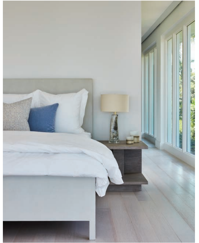
left: Adirondack chairs from DWR surround the fire pit. above: In the master suite, a bed from RH is dressed in neutral Matouk bedding for a serene feel. Lamps from Made Goods top nightstands from Holly Hunt.