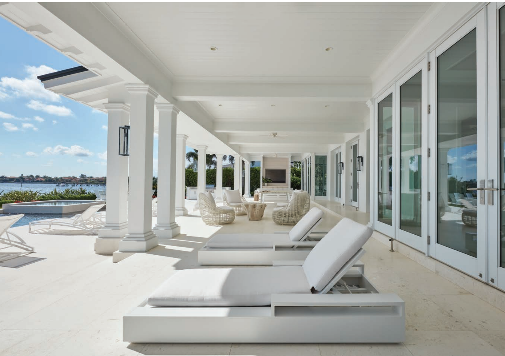
above: RH loungers are just steps outside the master suite on the first floor.

I love swivel chairs; you can turn around in them and see inside and out. The white mesh lounge chairs near the pool are so easy and low-maintenance, and you're not dealing with cushions. I also love the Roberta Schilling chairs at the end of the bed in the master suite. Overall, I just like the way the house feels. I'm kind of afraid of color [laughs], so my dream house is all white and glass. A lot of the pillows and throws were about bringing in texture, so there's a tonality to it. There are so many elements that layer in coziness.