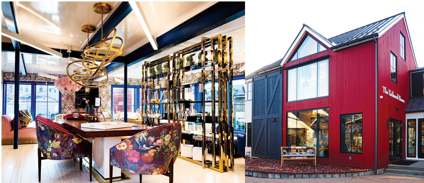
above: Focused on interior design, furniture design and a curated fabric library, The Tailored Home's new Westport location in Sconset Square is full of color and inspiration.