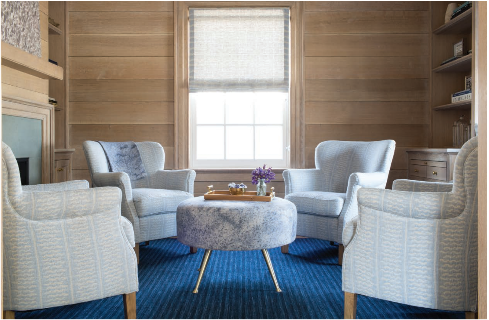
this spread: Grounded by a rug from Elizabeth Eakins, the cozy office is furnished with chairs from Serena & Lily in a C&C Milano fabric, and the ottoman fabric and blanket are both from Rosemary Hallgarten. A C&C Milano fabric was also used for the shades and the window seat pillow, all made by Artistic Upholstery. A photograph by Barbara Erdmann Photography hangs above the fireplace.

What were the priorities for this house? They wanted it to be very user-friendly—they're the most social family you'll ever meet, and they love entertaining. Things couldn't be precious, but they still needed to look really pretty. For instance, in the living room, those sectionals are outdoor furniture from B&B Italia. Since they're floating, it was important to me that they have a great-looking profile, but they needed to be durable as well. We used an indoor/outdoor fabric on them, and you can sit on the arms and they're not going to cave in. This is a party house, so we needed furniture that would hold up.