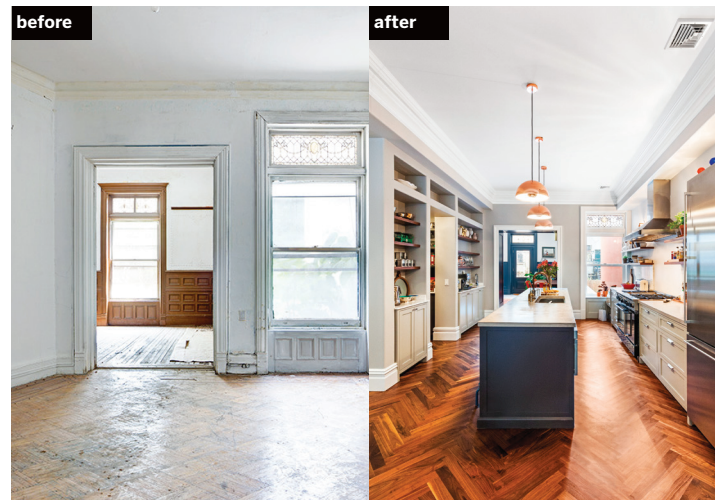
above and below: A classic wood pattern elevates this kitchen makeover; white subway tile paired with a marble hex floor increased the brightness tenfold in this renovated bath.

The operative word is “right.” I launched this company in 2011 after hiring the wrong contractor for my house...after going to architecture school and working in the industry! Many homeowners find us through real-life renovation stories on our blog. Word-of-mouth is also huge for us. On sweeten.com , when you click “Start your renovation,”