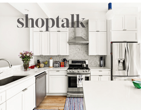
above: This sunny kitchen was part of a Brooklyn townhouse gut renovation.

value of the work to clients, which supports their work. The fun part is we commission photography and cover the stories on our blog and for our 500,000 Instagram followers, and we work with major design media to feature projects. We're there behind the scenes to make the design professional's work shine.