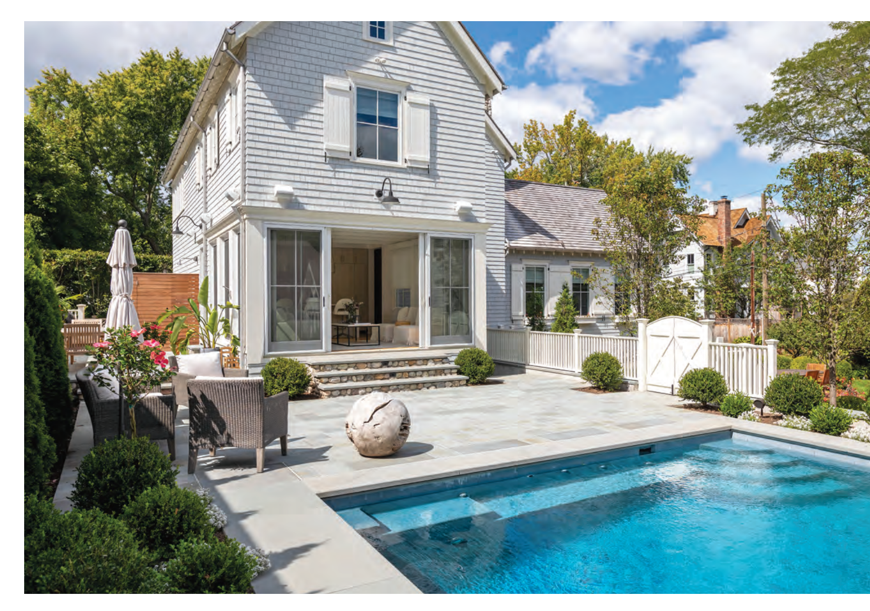
above: The family room opens up to the expansive patio and pool. Floor-to-ceiling windows and doors on the first floor create an indoor/outdoor feel.

This home has an interesting backstory. Yes, it does! The client works in the city, has a place in Palm Beach and summers in Rowayton. He owns the historic home next door, and he bought this property because he wanted to build a new house here where he could live during the summer and on weekends while keeping the historic home as a guest house. He's using both homes to entertain.