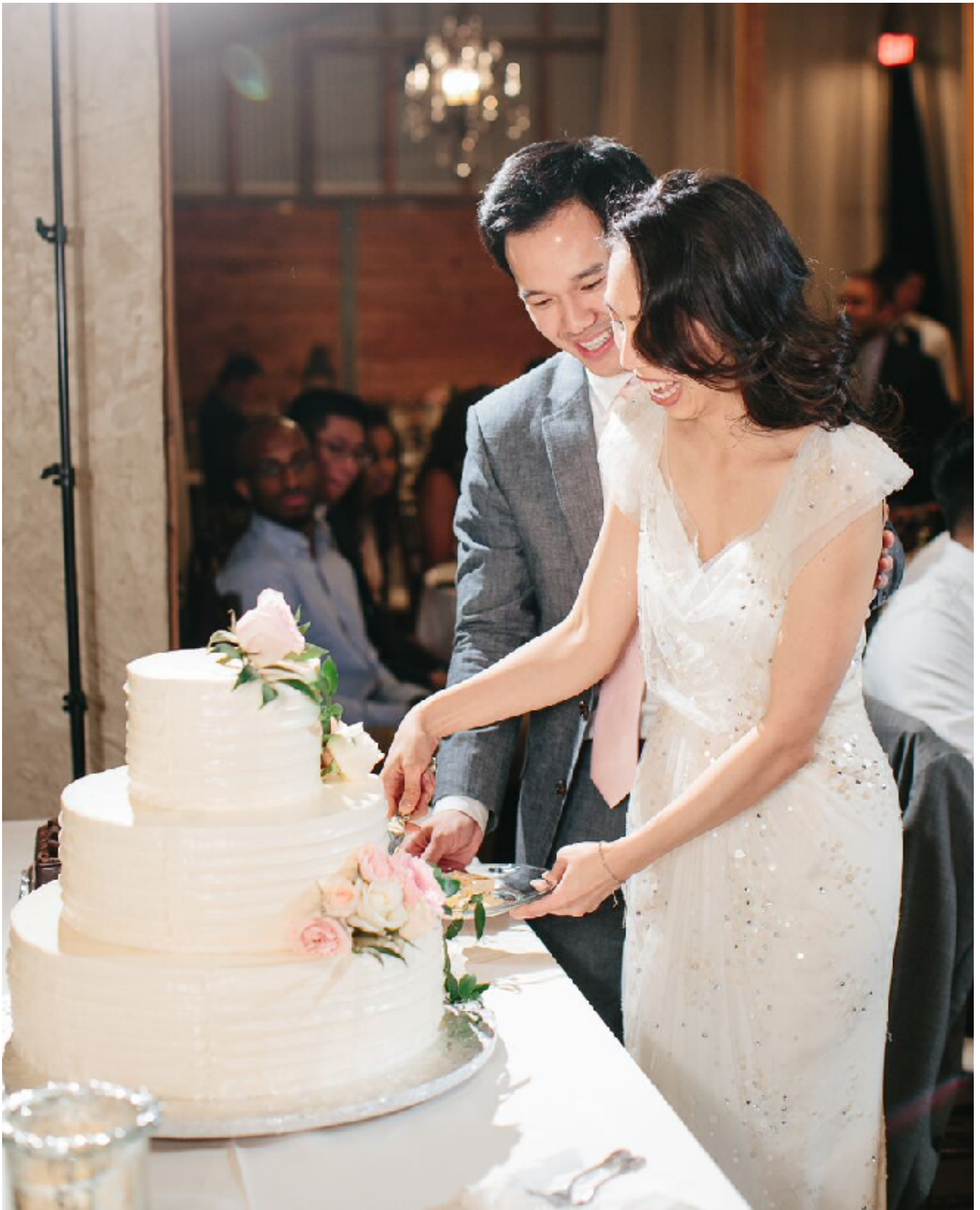
Planning a traditional wedding can be a real joy. There are so many decorative options available to you. A local wedding boutique will likely sell some traditional