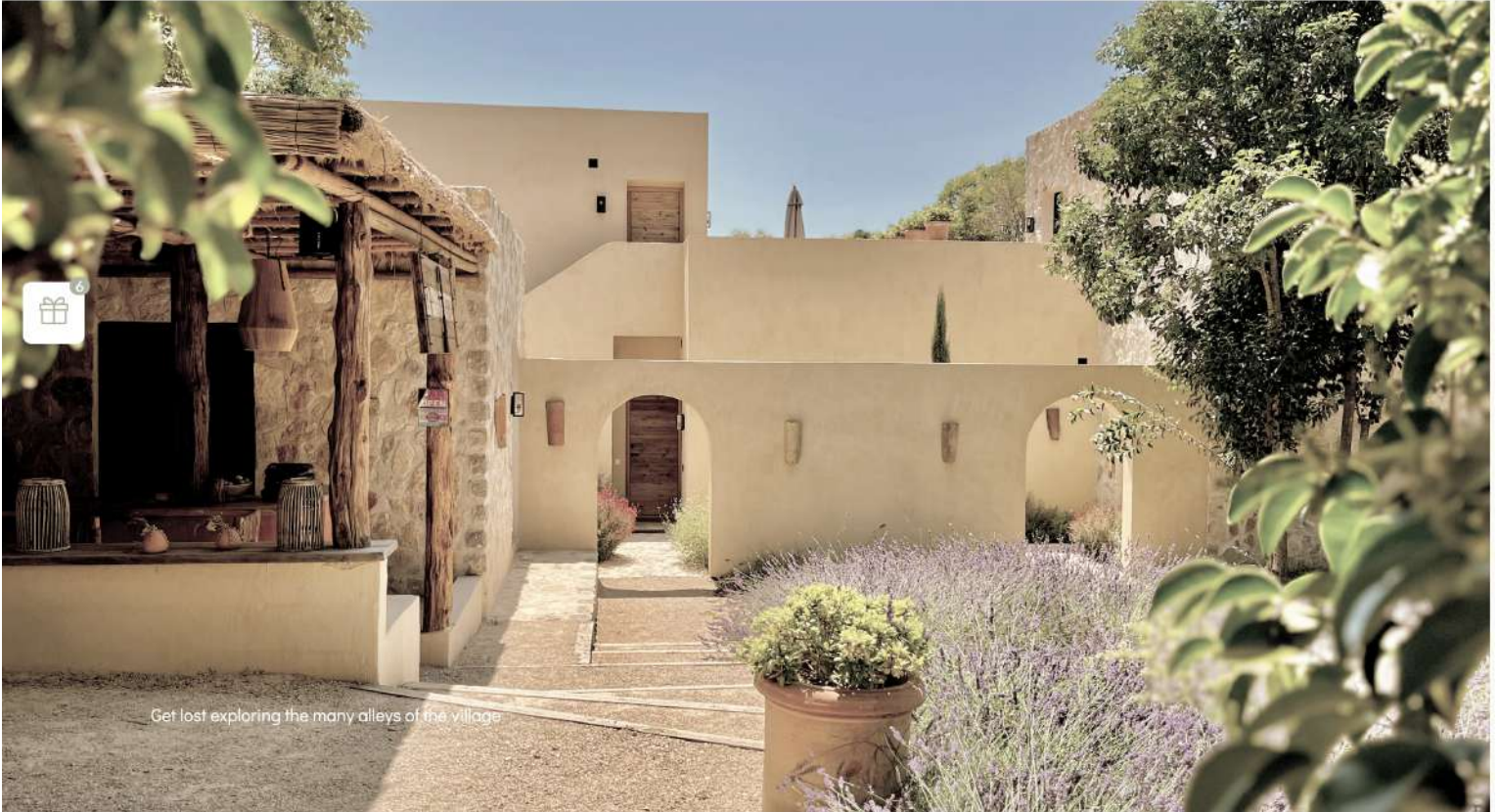
Get lost exploring the many alleys of the village

Lose track of time exploring the small paved streets of Saint-Paul de Vence. The charming medieval town is perched on a hillside overlooking the majestic Var valley, and is home to an array of galleries, specialty food and wine shops along with upmarket boutiques. It is the perfect romantic day-trip during your stay with us.