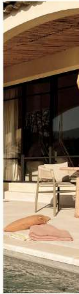
Suite du Bon-Vivant