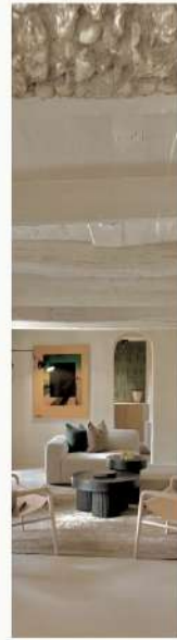
Mas de l'Artiste