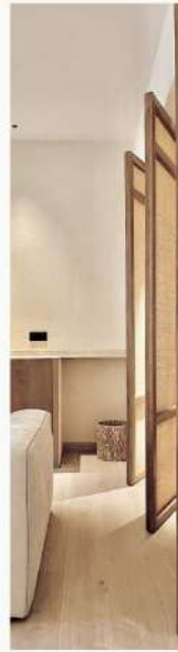
Suite de la Bronzette