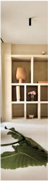
Suite de l'Artiste