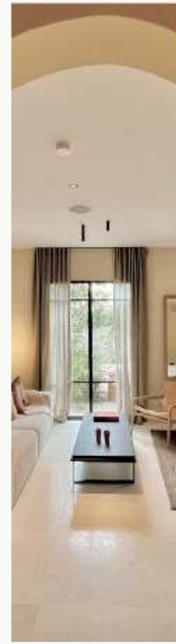
Villa du Pénéquet