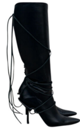
GUCCI BOOTS €450.00