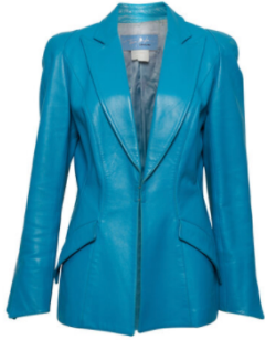
THIERRY MUGLER LEATHER BLAZER €850.00