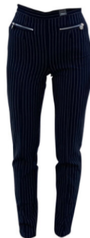
VERSACE PANTS €320.00