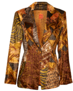
VELVET CHRISTIAN LACROIX BLAZER €520.00