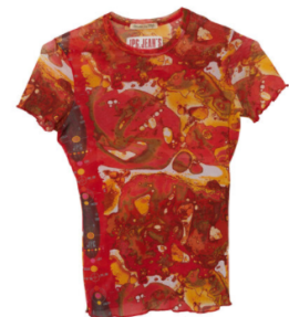
JEAN PAUL GAULTIER RED BACTERIA T-SHIRT €280.00