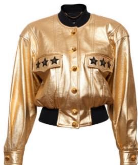
ESCADA LEATHER GOLD BOMBER JACKET €590.00