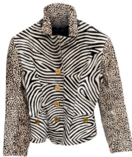
JEAN CLAUDE JITROIS ZEBRA JACKET €850.00