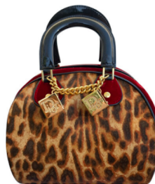
CHRISTIAN DIOR GAMBLER BAG €1,000.00