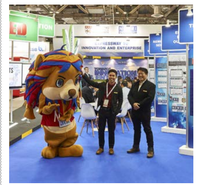
Above: Lyon, Nanyang Technological University's mascot, posing at the NEWRI Ecosystem booth

you manage the whole water cycle, and you do not just use water once. You use water as many times as possible