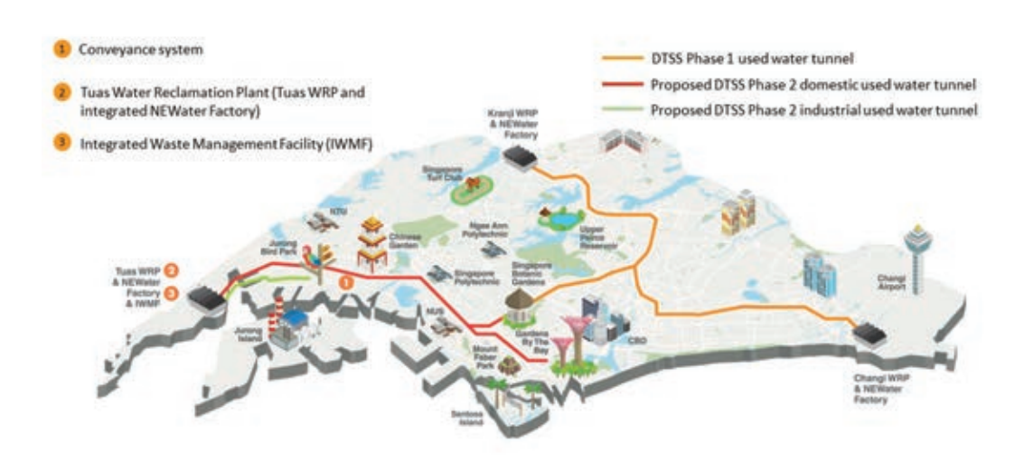
OVERVIEW OF DTSS

The DTSS uses deep tunnel sewers to convey used water entirely by gravity to centralised water reclamation plants (WRPs) located at the coastal areas. The used water is then