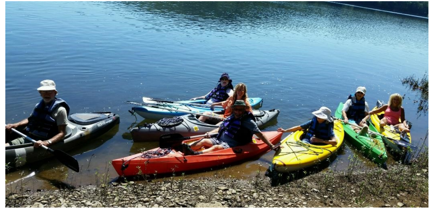
A group of Meadows residents, along with Maria Joseph staff, enjoyed a day of kayaking in July.