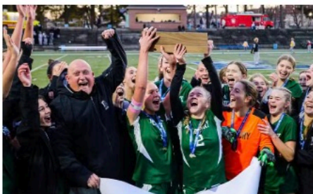
Duxbury celebrates its MIAA Division 2 championship over Longmeadow.