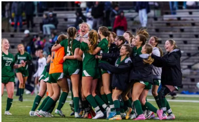
Duxbury celebrates winning the MIAA girls Division 2 state title.