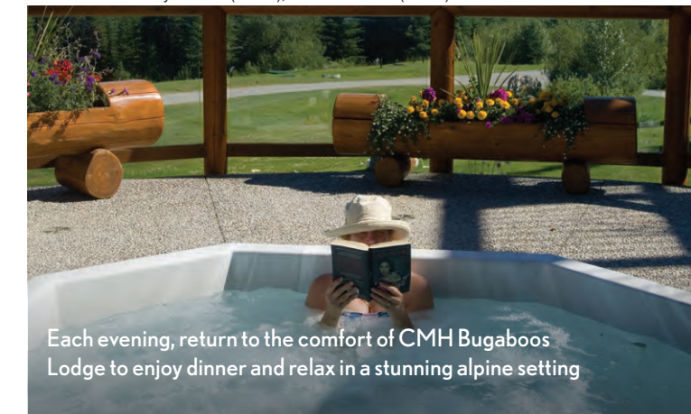
Each evening, return to the comfort of CMH Bugaboos Lodge to enjoy dinner and relax in a stunning alpine setting