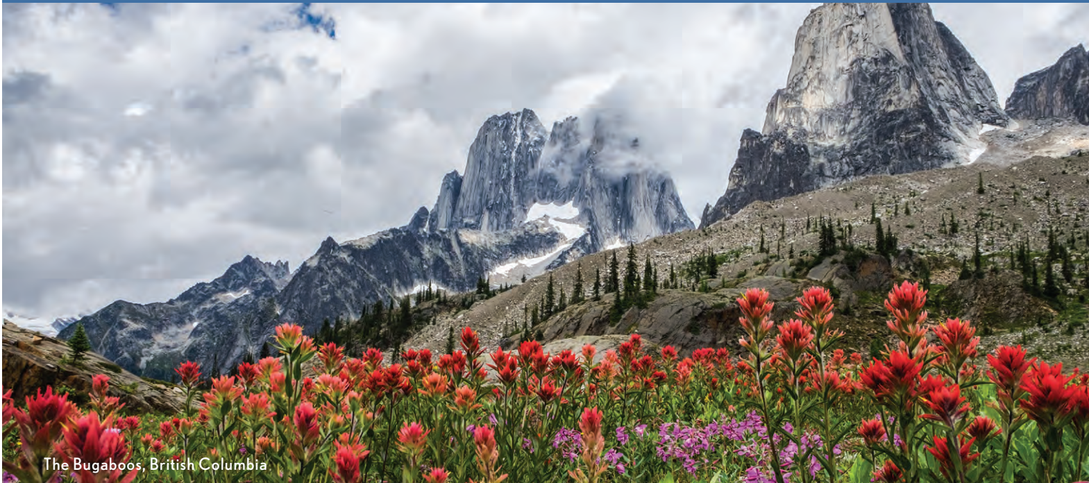
The Bugaboos, British Columbia

FEATURING HELI-EXPLORING 7 days from $6,790 plus airfare