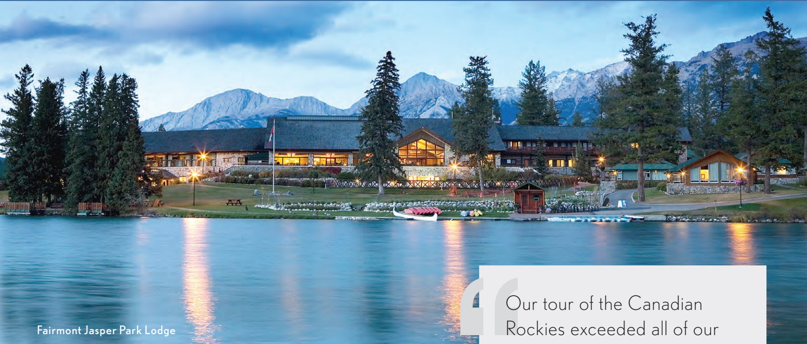
Fairmont Jasper Park Lodge

PREPARE TO BE DAZZLED... feasting your eyes on some of the world's most stunning natural scenery, before heading right into it for outdoor adventures you'll never forget. Step back to the Golden Age of Rail as you wind your way from Vancouver – British Columbia's mighty, multicultural port city on the Pacific coast – through the magnificent Canadian Rockies on a fabulous overnight rail journey aboard Via Rail's The Canadian train. And you'll explore this wonderland of glistening glaciers, rushing rivers and towering peaks from legendary inside-the-park Fairmont resorts in Banff and Jasper national parks.