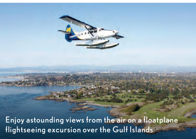
Enjoy astounding views from the air on a floatplane flightseeing excursion over the Gulf Islands