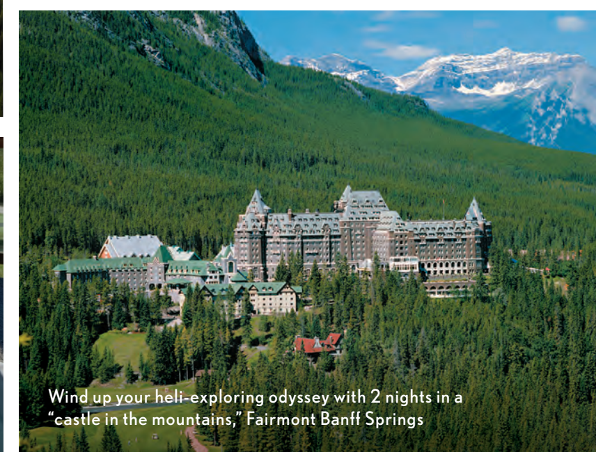
Wind up your heli-exploring odyssey with 2 nights in a "castle in the mountains," Fairmont Banff Springs