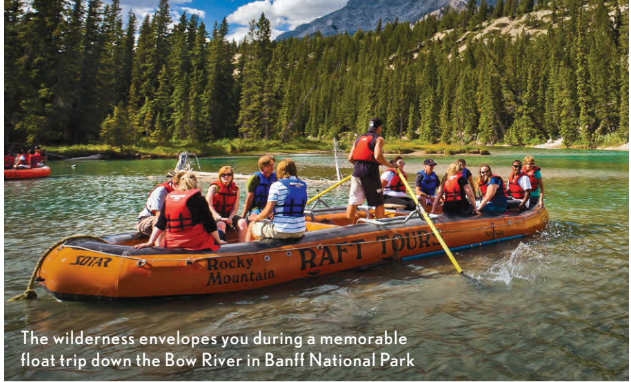
The wilderness envelops you during a memorable float trip down the Bow River in Banff National Park