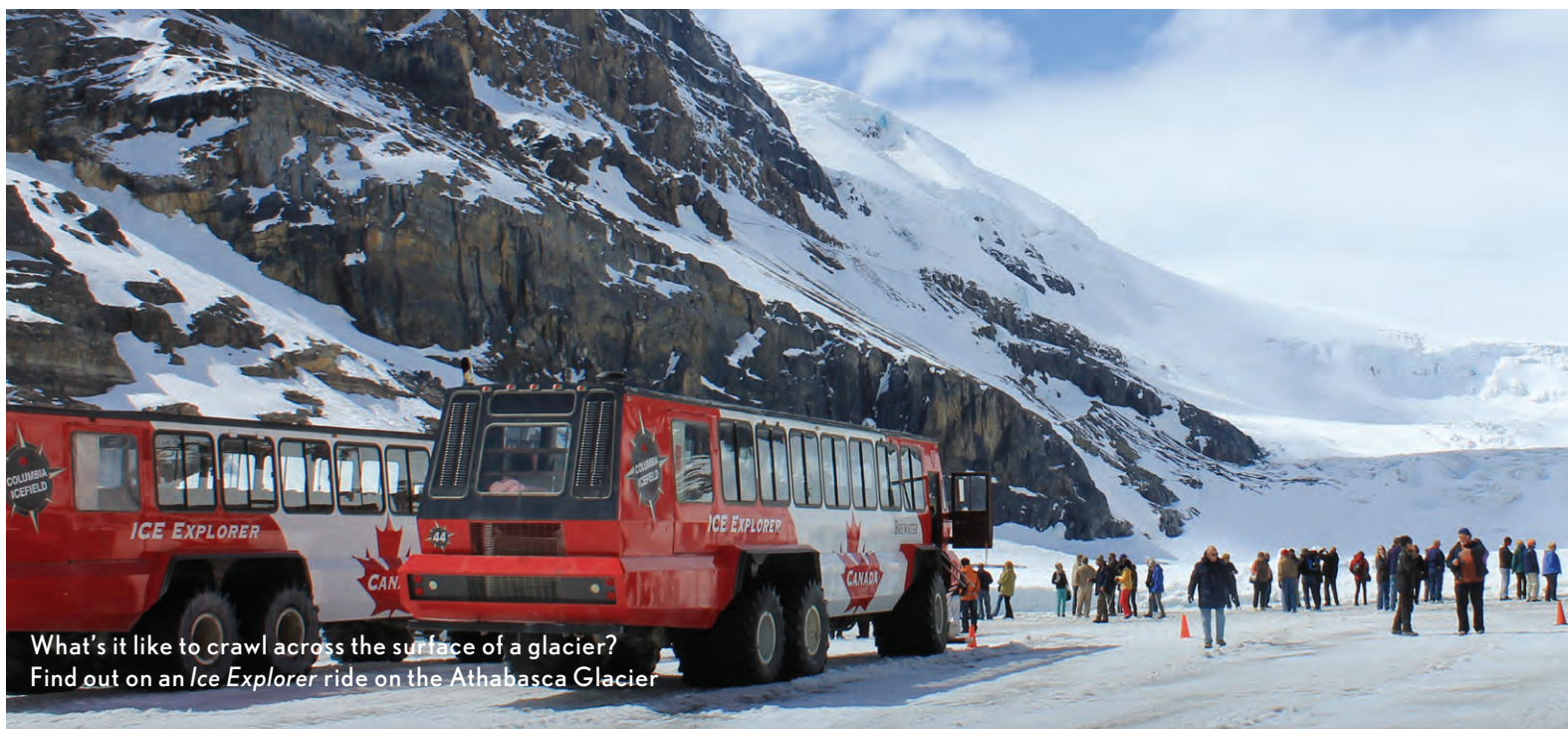
What's it like to crawl across the surface of a glacier? Find out on an Ice Explorer ride on the Athabasca Glacier