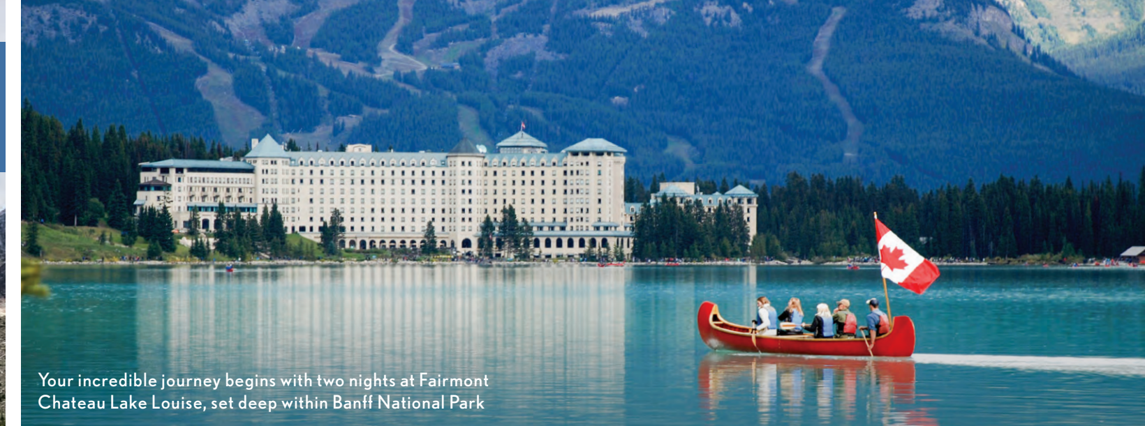
Your incredible journey begins with two nights at Fairmont Chateau Lake Louise, set deep within Banff National Park