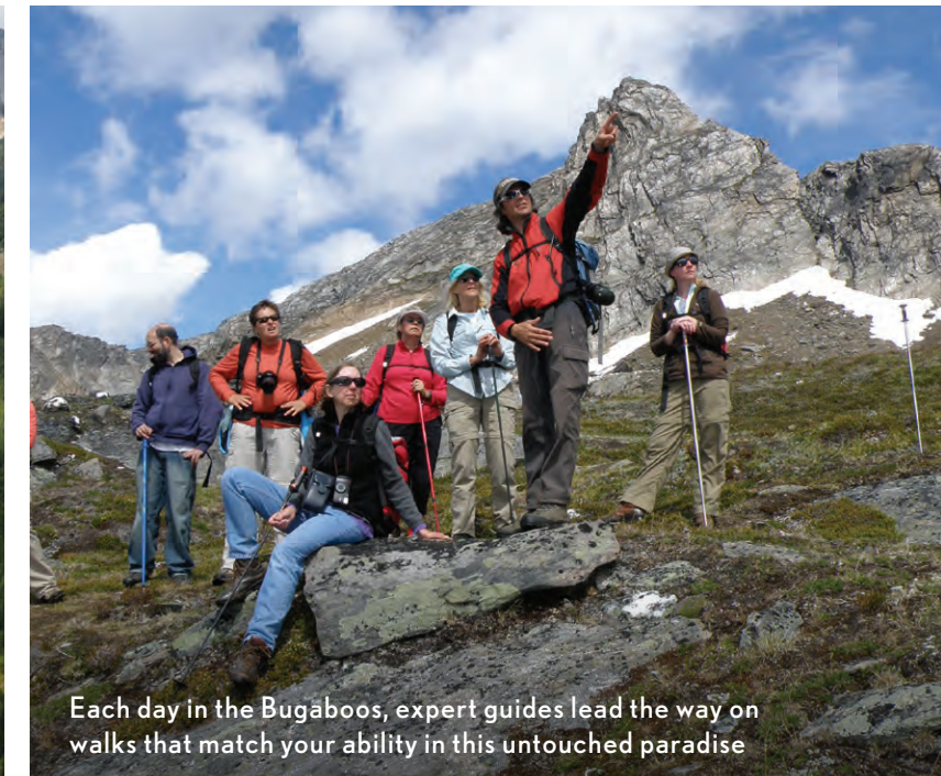
Each day in the Bugaboos, expert guides lead the way on walks that match your ability in this untouched paradise