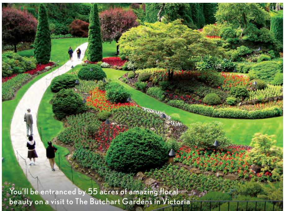
You'll be entranced by 55 acres of amazing floral beauty on a visit to The Butchart Gardens in Victoria