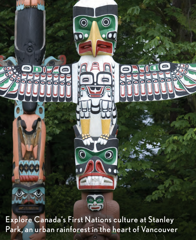
Explore Canada's First Nations culture at Stanley Park, an urban rainforest in the heart of Vancouver