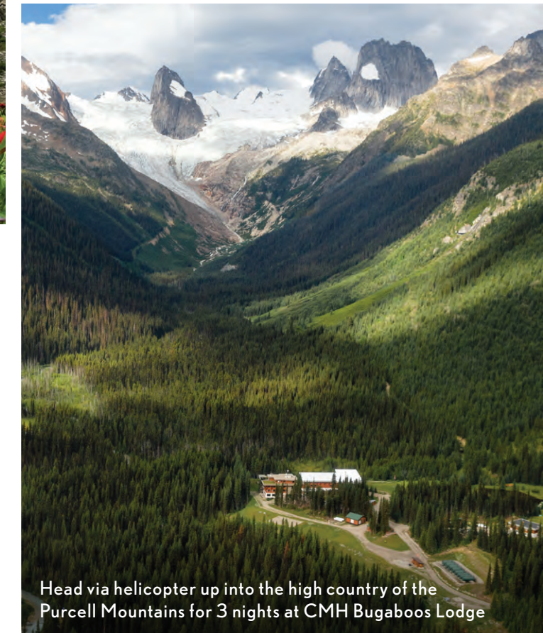
Head via helicopter up into the high country of the Purcell Mountains for 3 nights at CMH Bugaboos Lodge