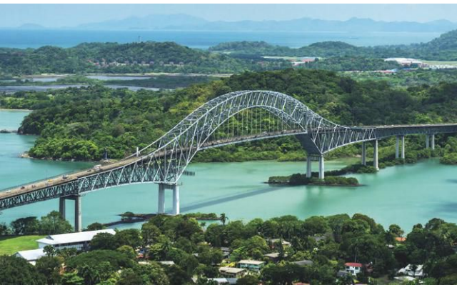
PHOTOS – Clockwise from above: Riding an aerial tram through the treetops at Panama's Gamboa Rainforest Resort; The Bridge of the Americas in Panama (which Tauck guests sail under during their cruise); visiting Costa Rica's gem-like National Theatre in San José (The Panama Canal & Costa Rica)