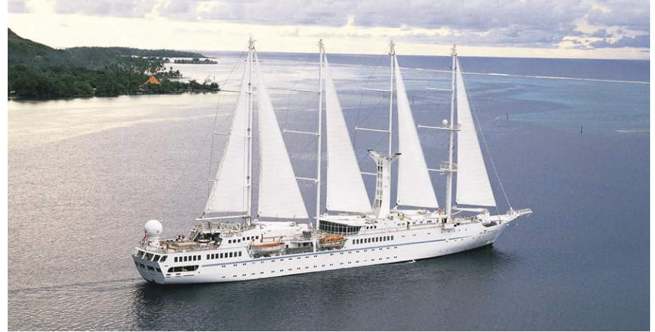
PHOTOS – Above: Windstar Cruises' four-masted Wind Star . Below: Windstar's power yacht Star Legend .