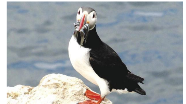
Icelandic treasures awaiting Tauck cruisers include Godafoss (“the falls of the gods”) and the inimitable puffin (Iceland: Land of Fire & Ice)