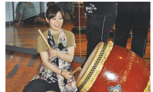
PHOTOS – Above, left to right: An incredible sunset at the iconic Torii gate of the Miyajima-Itsukushima Shrine in Hiroshima, Japan; a lively demonstration of traditional Taiko drumming in Kyoto (Cruising the Land of the Rising Sun)