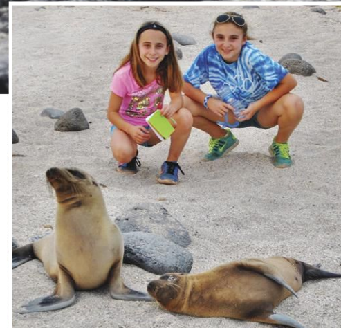
PHOTOS – Above: Tauck cruisers explore Fernandina Island in the Galápagos as a marine iguana holds court nearby (Peru & the Galápagos Islands). Left: Making friends with sea lions in the Galápagos (Galápagos: Wildlife Wonderland)