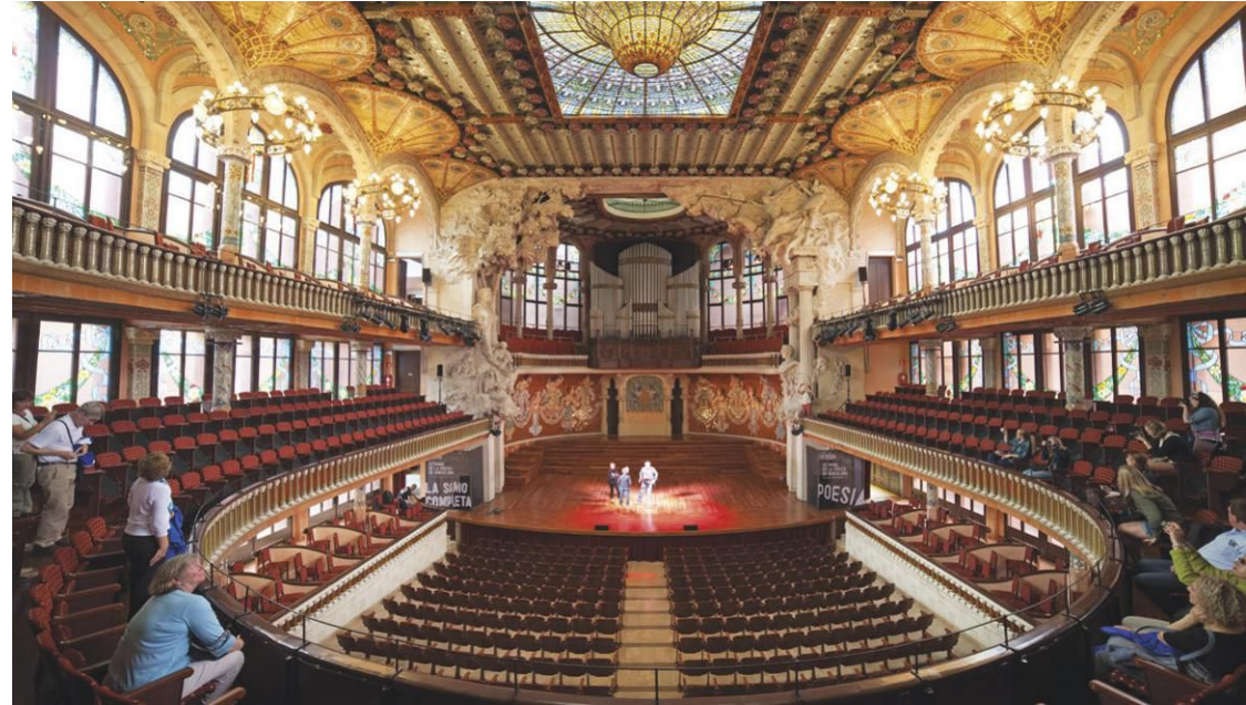
PHOTOS – Above: Private visit to Barcelona's Palau de la Música Catalana (Treasures of Spain and Portugal). Below: Typical of the world-class hotels enjoyed on Tauck Small Ship Cruise land stays – Mandarin Oriental, Tokyo (Cruising the Land of the Rising Sun, left); Hotel Danieli, Venice (Venice & the Dalmatian Coast, right)

We invite your clients to step aboard and experience the extraordinary in small ship cruising – as only Tauck can do it.