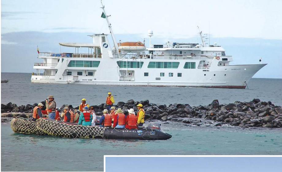
PHOTOS – Above: Metropolitan Touring's expeditionary yacht Isabela II . Right: Santa Cruz II