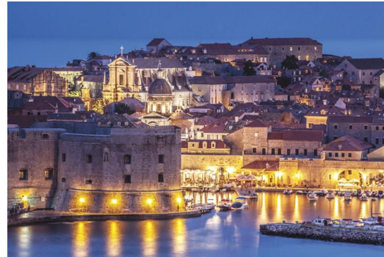
PHOTOS – Clockwise from left above: Visiting modernist Spanish architect Antoni Gaudí's incredible (and unfinished) la Sagrada Família in Barcelona (Treasures of Spain and Portugal); taking in breathtaking views of Italy's Amalfi Coast from clifftop Ravello (Sicily, the Amalfi Coast & Rome); and discovering the stunning medieval cityscape of Dubrovnik, Croatia, at night (Venice & the Dalmatian Coast)