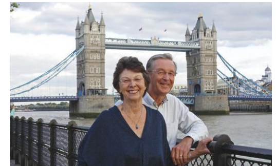
PHOTOS – Above, clockwise from top: Exploring The State Hermitage Museum (St. Petersburg & the Baltics); admiring London's Tower Bridge (Treasures of the British / Irish Isles); Bergen's historic harbor, Bryggen (Norwegian Fjords & Coastal Treasures)