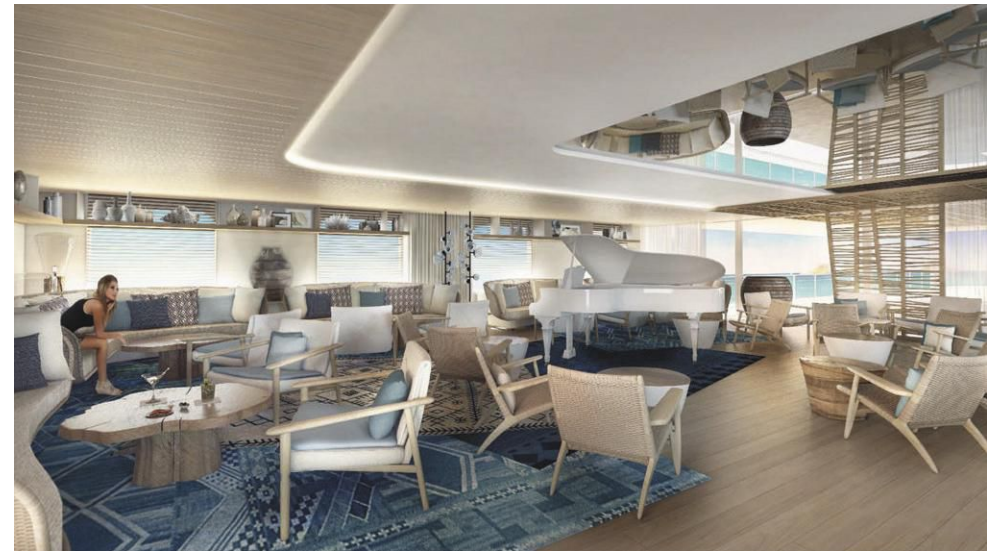
Interior artist's rendering of Ponant's new small ship, Le Lapérouse

The Tauck family has long had a passion for sailing – and once we started taking guests on small ship cruises of our own, it was evident that we would blend our land experience with our strong passion for cruising, and that our guests would sail the seas in the same beyond-the-ordinary Tauck style they experienced on land. Eventually, we found partners who share our values and our commitment to providing a small ship cruise experience inspired by the destinations we explore, and that would match our guests' experience ashore... Whether the cruise is Tauck guests only or a shared ship experience with our partners, Tauck guests enjoy a small ship cruising experience that's second to none.