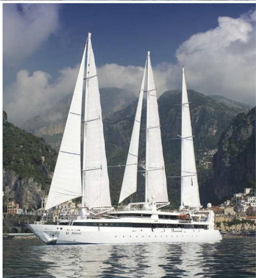
PHOTOS – Above: Ponant sister ships L'Austral and Le Soléal. Left: Le Ponant.