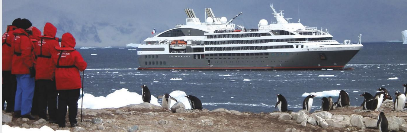
Penguins greet Tauck guests – now intrepid Antarctic explorers – on the Antarctic Peninsula as Le Boréal stands by offshore (Antarctica)