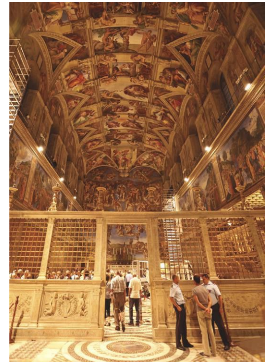
PHOTOS – Clockwise, from top: Guests gather on one of Rábida Island's red-sand beaches (Cruising the Galápagos Islands); Tauck's after-hours guided visit to the Sistine Chapel and the Vatican Museums (Sicily, the Amalfi Coast & Rome); dining topside aboard Le Boréal.