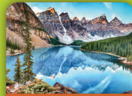
WONDERS OF THE CANADIAN ROCKIES

Want to see historic places you have read about? Like royal castles, Imperial palaces, the Sistine Chapel, the Tower of London, the Eiffel Tower, the Louvre and other world-famous, centuries-old sites so beautiful they make your jaw drop?