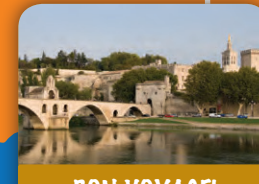
BON VOYAGE! FRANCE FAMILY RIVER CRUISE