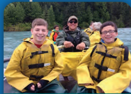
ALASKA: CALL OF THE WILD