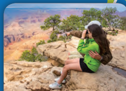
RED ROCKS & PAINTED CANYONS