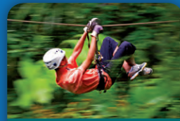
COSTA RICA: JUNGLES & RAINFORESTS