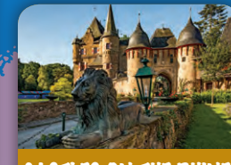
CASTLES ON THE RHINE: FAMILY RIVERBOAT ADVENTURE