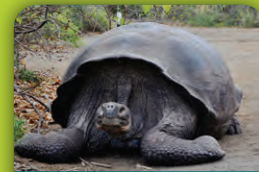
GALAPAGOS: WILDLIFE WONDERLAND