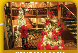
HOLIDAY MAGIC: DANUBE FAMILY RIVER CRUISE