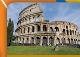
THE SWEET LIFE: ROME & SORRENTO