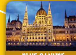
BLUE DANUBE: FAMILY RIVERBOAT ADVENTURE