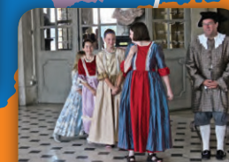
GRAND EUROPEAN FAMILY HOLIDAY