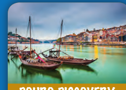
DOURO DISCOVERY: A FAMILY RIVER CRUISE IN PORTUGAL