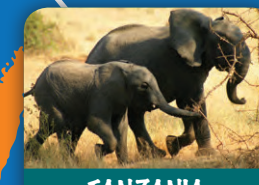
TANZANIA: A GRAND FAMILY SAFARI