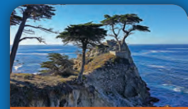
MAJESTIC CALIFORNIA: SAN FRANCISCO, YOSEMITE & THE PACIFIC