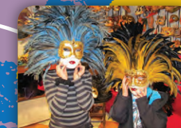
ITALIA BELLA: ROME TO VENICE