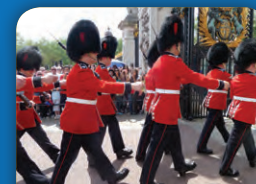
CASTLES & KINGS: LONDON TO PARIS