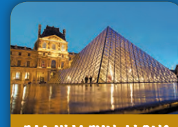
FAMILY FUN ALONG THE SEINE: PARIS TO NORMANDY