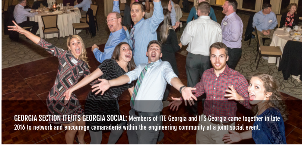
GEORGIA SECTION ITE/ITS GEORGIA SOCIAL: Members of ITE Georgia and ITS Georgia came together in late 2016 to network and encourage camaraderie within the engineering community at a joint social event.