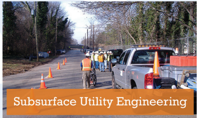
Subsurface Utility Engineering