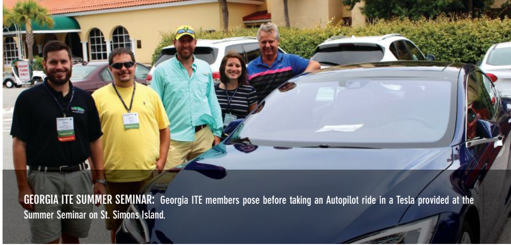
GEORGIA ITE SUMMER SEMINAR: Georgia ITE members pose before taking an Autopilot ride in a Tesla provided at the Summer Seminar on St. Simons Island.