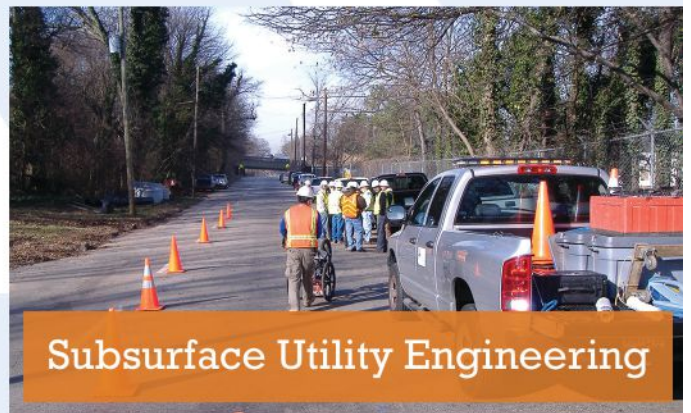
Subsurface Utility Engineering