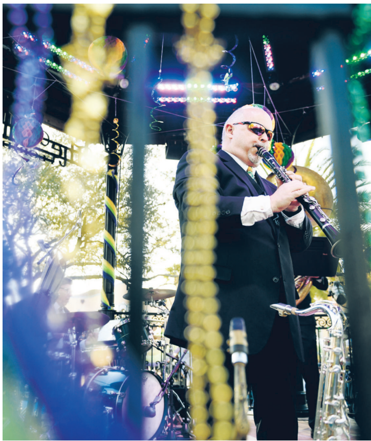
A band plays during the 2019 Mardi Gras Festival at Spanish Springs Town Square.

"Our goal is to create an unforgettable experience here in The Villages, and I hope we can go above and beyond the expectations to execute our goal," she said. "I hope people take home fun and exciting memories from our festivals, and continue to enjoy what the squares have to offer on a daily basis."