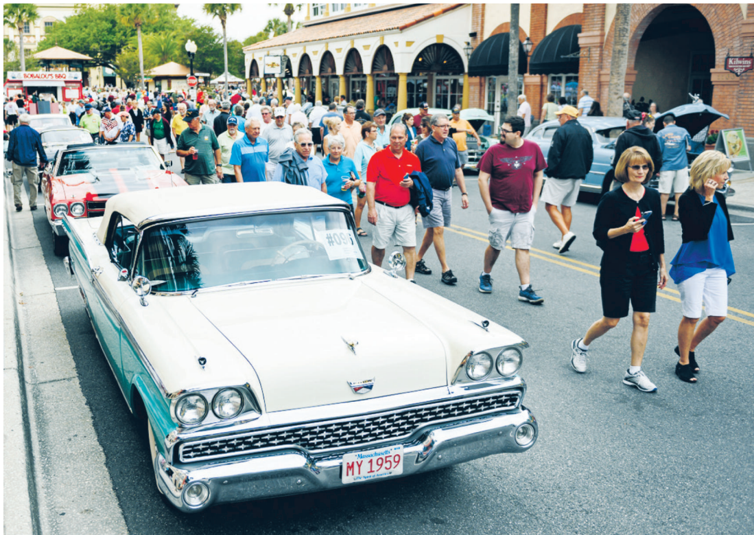
People walk the square while looking at classic cars during a cruise in at Spanish Springs.

The event, which is sponsored by Pelican Water and